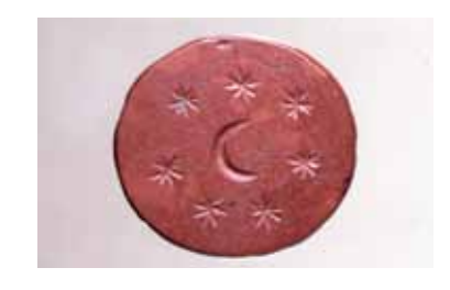
\textbf{Plate 2} \, \text{Red jasper (15 x 13 x 4mm)}. \, \text{London, British Museum, PE 1849,1127.16}

But the pastil of Polyidus called the 'seal', sphragis autem nominatur , is by far the most celebrated. It contains split alum 4.66g, blacking 8g, myrrh 20g, lign aloes the same, pomegranate heads and ox-bile, 24g each; these are rubbed together and taken up in dry wine. <sup>12</sup>