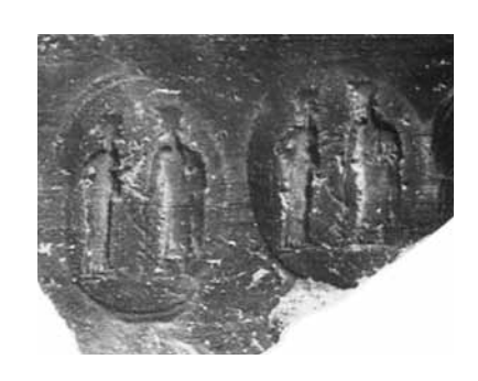
Plate 5 Pot fragment, from Aquincum (size of the printed gem: 19 x14mm). Present location unknown