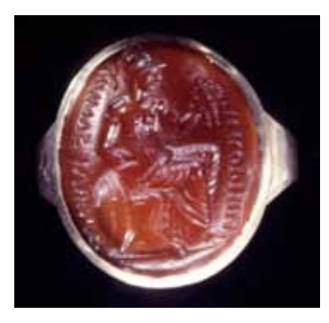
Plate 7 Carnelian, 19 x 16mm. London, British Museum, PE 1859,0301.118

also a container for a medicine.<sup>44</sup> Unfortunately, it is so fragmentary that no conclusion can be drawn, but it is interesting to note that the image was made with a gem, perhaps magical, as the type exists, as on a dark brown agate from the British Museum ( Pl. 6a ) showing Chnoubis on the reverse ( Pl. 6b ).<sup>45</sup>