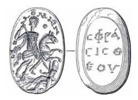
Plates 8a-b Haematite (25 x 15 x 4mm). London, British Museum, PE G 87

It may be noted that the iconography of the horseman subduing the female demon appears when the figure of Heracles mastering the lion disappears. Solomon seems to have taken over the capacity of the hero. Like Heracles, who controlled the roaming of the womb (compared with a wild animal), variants depict Solomon with the hystera formula. Solomon had power over all diseases inflicted by demons, including the fear of poisoning, mastered by haematites, like the red Lemnian earth.