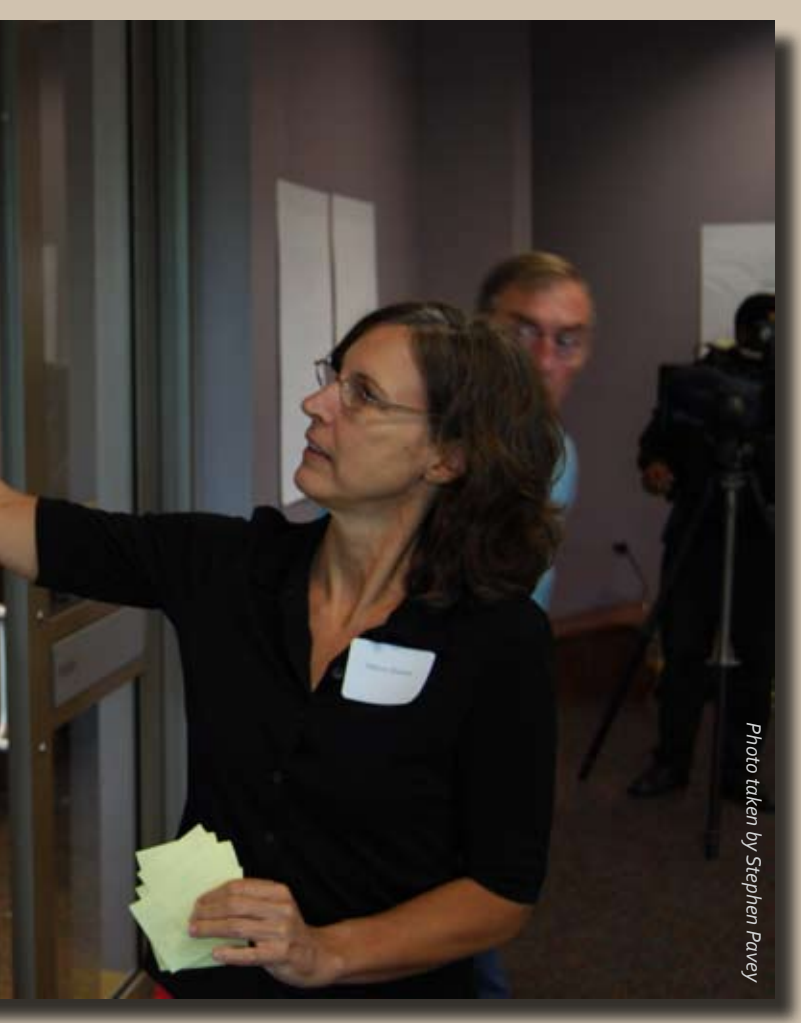
mmunity, participated in the Bowling Green Regional Forum to assess needs.

and smoking cessation. The unit will be able to offer assistance with disease management or drug regimens, with a nurse practitioner that can diagnose, treat, prescribe and dispense medications. This unit will also attempt to decrease the number of uninsured persons by conducting intake interviews to determine eligibility for various programs and services and to provide assistance with completion of required forms.