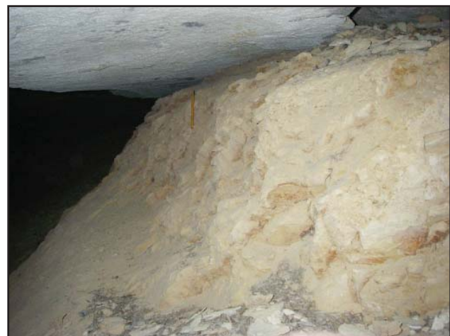
Figure 3: Vertical face of working bay along north wall at 120 m from cave entrance.

Saltpeter Cave. The most obvious evidence is the working bays where the peter-laden soil was mined. A working bay is a “cavity produced by the mining of soil . . . identifiable as a niche in a soil bank bounded on three sides by a high wall excavation face” (George 1986b:96). Working bays are present throughout all passages within the cave, where their dimensions vary depending on the depth of the cave sediments and the size of the cave passage. There was extensive sediment mining in the vestibule of the cave, where a medial trench measures as much as four m wide and three m deep (though it is possible the entire vestibule was mined and the trench represents a trail between lateral piles of re-deposited processed sediment). Midway through the trunk passage the face of the excavated sediment is as much as four m high (Figure 3). The miners also removed sediment from lateral ledges along the trunk passage in the vestibule. The ledges are one-two m above the current cave floor, but they likely were below the floor of the infilled cave prior to mining. As such, the ledges were exposed by the mining and do not represent balcony alcove working bays (c.f., George 1986b).