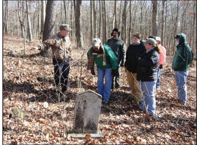
Figure 6. Participants in a weekend workshop visit the grave of William Bransford while learning about the history and contributions of African Americans to the Mammoth Cave area.