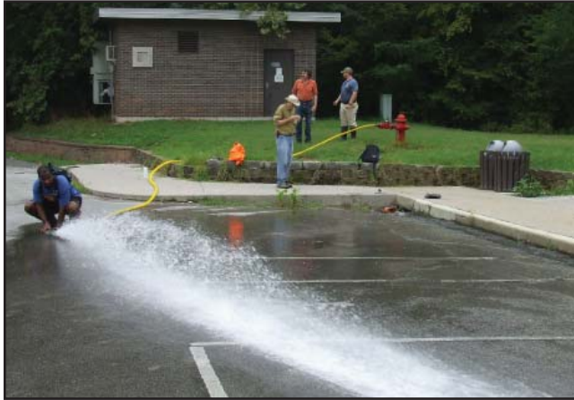
Figure 1. Tennessee State University students test the parking lot filter system in preparation for a larger project looking at parking lot runoff around Mammoth Cave.

MCICSL coordinates the research for Mammoth Cave National Park, including overseeing the research permit applications process. Through permitted research and research projects managed through agreements and other mechanisms, MCICSL facilitates