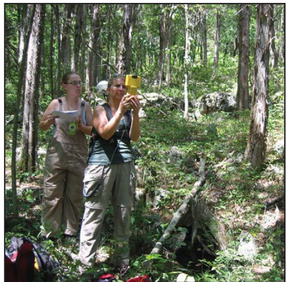
Figure 7. Two Geoscience-Teacher-in-the-Park interns assist park scientists by recording the GPS coordinates of a newly discovered cave entrance.

For the past three years, MCICSL has collaborated with Mammoth Cave’s Environmental Education Division and the National Association of Geoscience Teachers to offer summer internships for local teachers. The teachers gain hands-on exposure to the variety