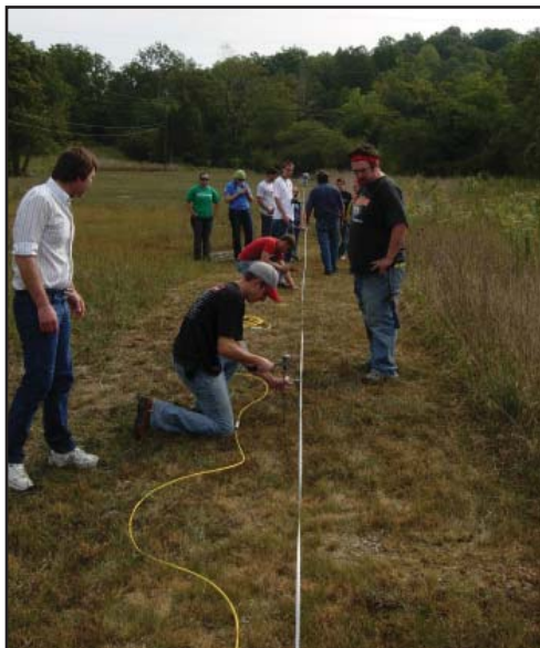
Figure 2. Wittenberg University geology students use Electrical Resistivity Ground Imaging to look for cave passages near the park.

research by state and federal agencies, non-governmental organizations, private researchers, and numerous universities. MCICSL staff also assists the researchers in obtaining lodging, working with park staff and volunteers, and other logistical needs.