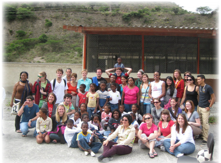
Above, a WKU student stands in the first building the cooperative built with their investment from the sale of baskets. Bottom left, WKU staff and students provide dental health care to Gales Point's residents. Bottom Right, WKU students and faculty and teachers and students of an Afro-Ecuadorian community rest in front of a school in the Chota Valley. Right page, children gather in Sanka Village, Ghana.