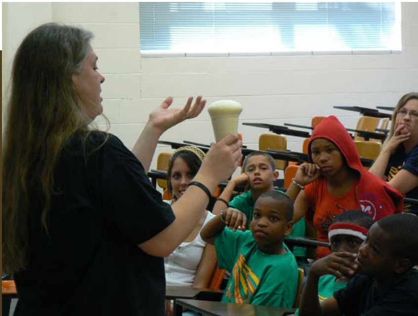
For the last six years, the Gender and Women's Studies Program at Western Kentucky University has coordinated a unique learning environment for women and children. The Women & Kids Learning Together Camp provides opportunities for women and their children to build upon what already lies within them.