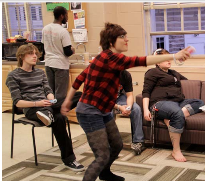
Teams of Western Kentucky University students participated in the Wii™ the People Bowling League during the spring of 2011. While half of the team bowled, the other half discussed civic issues.

The league provided a framework for students to intentionally engage in civic dialogue. The informal setting of the bowling league provided each participant an opportunity to comfortably share their own opinion, listen to different perspectives, and realize that common ground is achievable with compromise. At the ICSR, students are discovering the wonderful advantages of not "bowling alone."