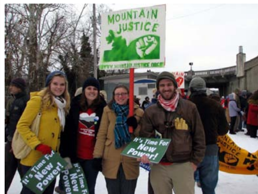
Students at WKU actively engage in learning opportunities for issues such as poverty, homelessness, and mountain top removal.