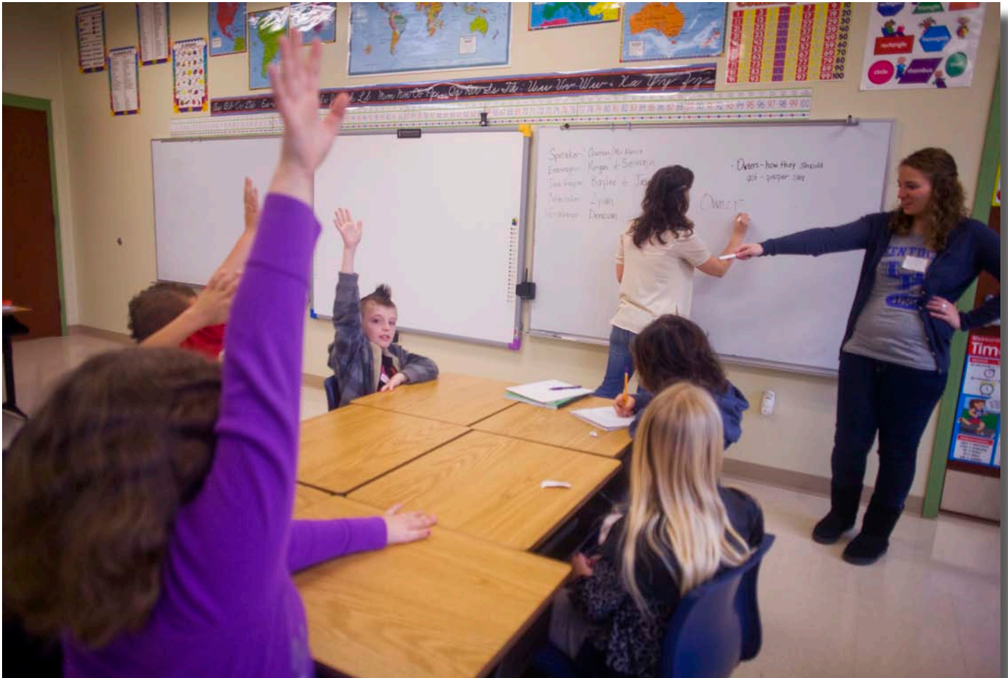
Student learning through community engagement takes the classroom into the community. The photos on the left page include youth participating in an activity on poverty as well as students learning the fundamentals of service-learning. In the photo above, youth learn how to work together to address community issues.