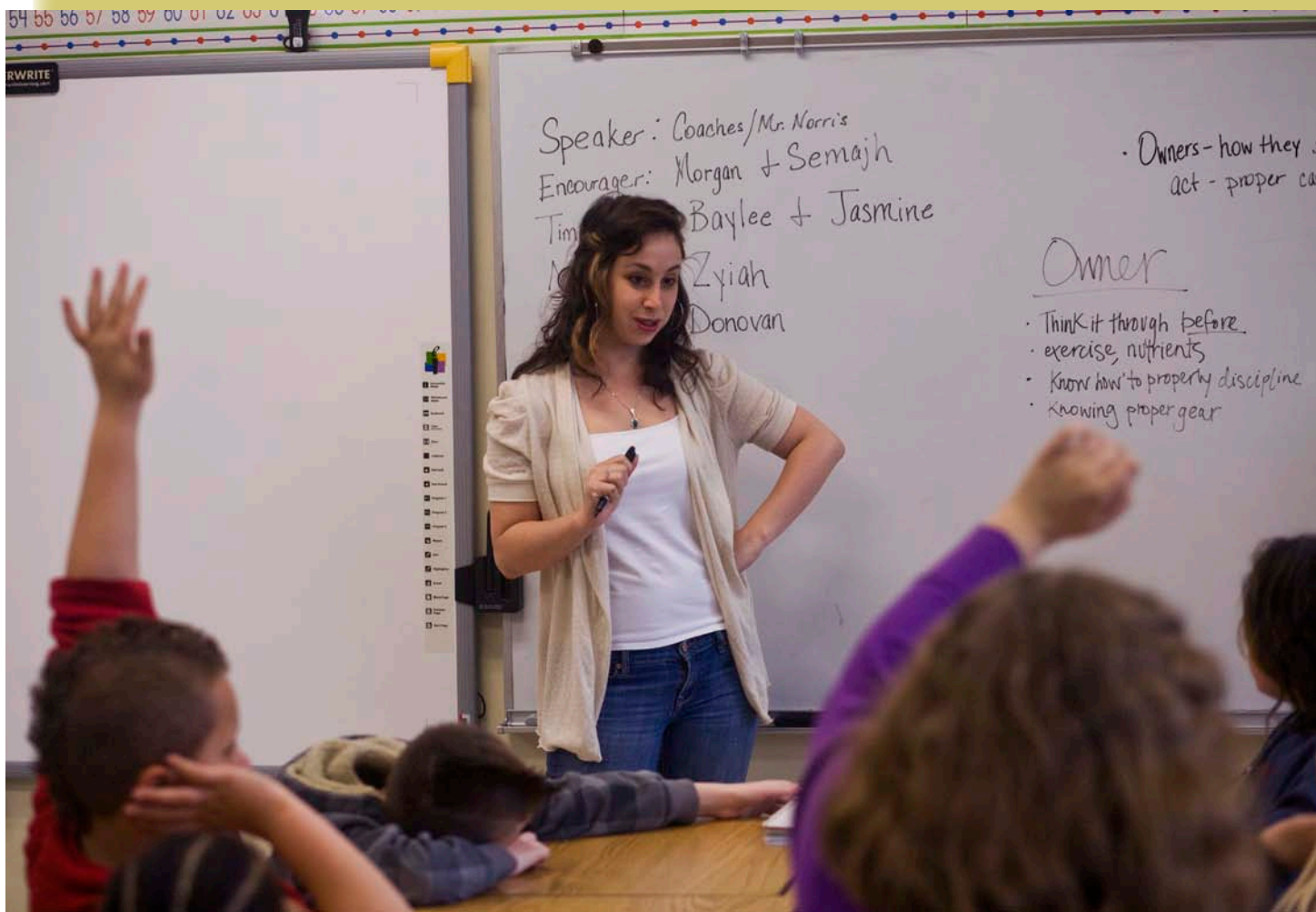
Western Kentucky University students serve as coaches in the Public Achievement program, working with third and tenth graders at T.C. Cherry Elementary and Bowling Green High School. During the spring 2011 semester, the coaches met with the youth regularly to help them address a community issue.

P ower. Do you have access to it? Is it something you can have? This spring, third and tenth graders in Bowling Green addressed those very questions. Representing T.C. Cherry Elementary School and Bowling Green High School, students involved in Kentucky's Public Achievement pilot program grabbed the reins of power to address issues within their own communities. Developing "civic co-creators," Public Achievement drives youth to actualize their own power to affect change within their community. Using public problem-solving techniques, two groups at T.C. Cherry Elementary School and one group at Bowling Green High School met weekly to tackle self-identified community challenges. Realizing that power manifests itself as the ability to get things done and is not something one person possesses and others lack, students learn to become active producers rather than consumers of their worlds.