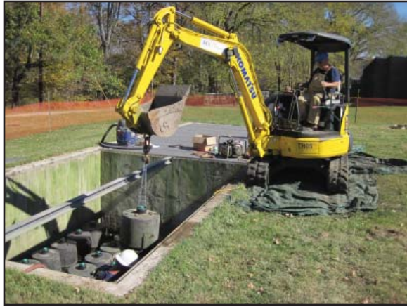
Figure 1: Contractors serviced the storm-water filters by swapping the cartridges. (Hotel-east shown here)

ammonia, fecal bacteria, dissolved iron, and chemical oxygen demand (Figure 2). For the first sampling round, the filters had not been serviced for 8 years and did very little to remove contaminants. The contaminant concentrations at the outlet were similar to those at the inlet, with the exception of removing 20-70 percent of the oil and grease. After replacing the cartridge filters and cleaning debris out of the oil-grit separators, the re-conditioned filters did little to remove copper and ammonia from runoff waters. However, the re-conditioned filters removed up-to 99% of the benzene, toluene, ethyl-benzene and xylene, and up to 90% of the turbidity, E. coli, Chemical Oxygen Demand and iron from the storm runoff. These results indicate that well-maintained filtration systems are more effective than clogged filters at removing many but not all contaminants from parking lot runoff.