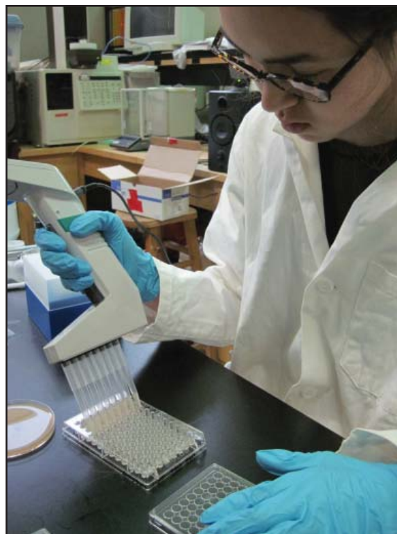
Figure 6: Honors high school students helped run microbial tests on the cave samples.

This partnership between Mammoth Cave National Park, U.S.G.S., Mammoth Cave International Center for Science and Learning, and, Tennessee State University to investigate water-quality in the Park had many positive outcomes. Some results were very tangible, such as, the monitoring results used to influence management decisions or document current ecosystem conditions. Results that were difficult to quantify include