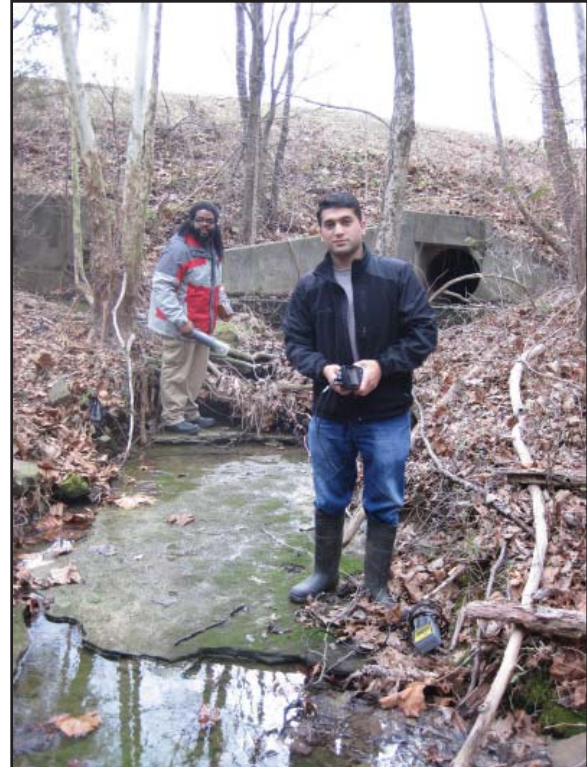
Figure 4: TSU students installed instruments to monitor road runoff at Silent Grove.

then held steady at low concentrations in the cave flowpath. Phosphate and sulfate decreased along the surface flowpath, but increased slightly in the cave. This is reasonable considering there are natural sources of sulfate and phosphate in the limestone at Mammoth Cave National Park. Bacteria were cultured and evaluated for resistance to the microbicides called quaternary ammonia compounds (Figure 6). Soil-water bacteria collected near the White Nose Disinfection Stations and RV Dump Station had a much greater resistance to QACs than bacteria collected in pristine areas, indicating they are developing antibiotic resistance. Specific conductance in flowing cave waters ranged from 200-250 uS/cm. Storms had a temporary dilution effect on specific conductance in those same cave waters. An extreme storm that showered 2 inches in 24 hours caused the conductivity to