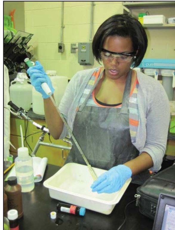
Figure 2: TSU students prepared water samples and ran chemical analyses.

In 2011, the National Park Service began deliberations concerning the application