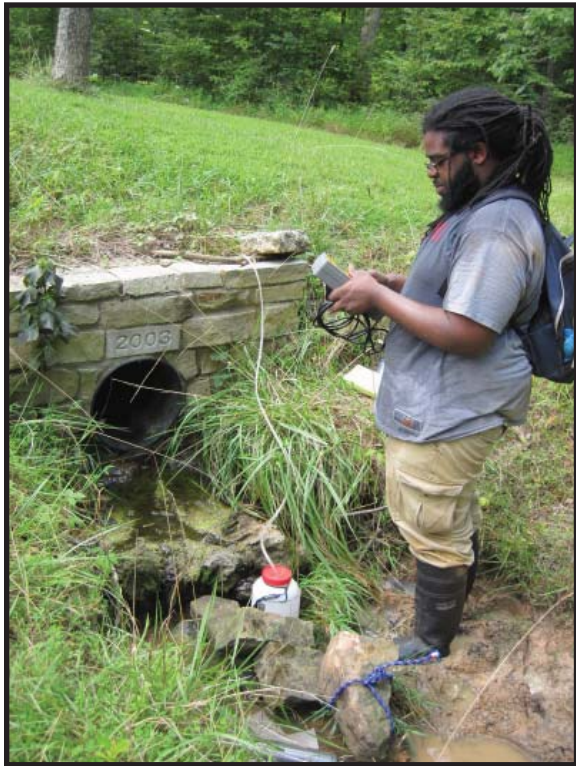
Figure 3: TSU student setting up a monitoring station at the storm-filter outlet.

of road deicers on primary roads through the Park. However, the NPS lacked some essential quantitative information with regards to contaminant transport from land surface into the cave ecosystem. The objective of this investigation was to characterize storm flow from potential source areas on the surface into the cave. The preliminary results were achieved by monitoring water chemistry and bacteria near source areas, along the surface flowpaths, and along known flowpaths in the cave (Figure 4). A quantitative tracer study found it took one hour for dye to move from land surface, along the main flowpath, and into the cave (Figure 5). Constituents, such as quaternary ammonia compounds (QACs), chemical oxygen demand, ammonia, and diesel range aromatic ring compounds, decreased exponentially along the flowpath, to below detection levels in the cave. Zinc, copper, and nitrate decreased along the surface, but