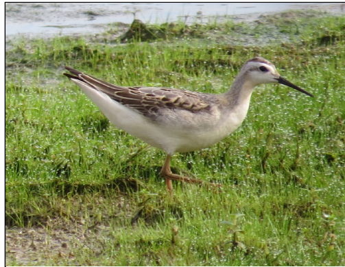
Wilson's Phalarope, Rowan Co. 1 September 2013 Brian Wulker