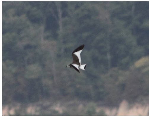
Sabine's Gull, Kentucky Lake 19 September 2013 Eddie Huber