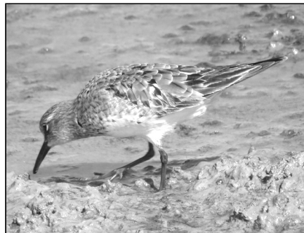
White-rumped Sandpiper, Rowan 17 September 2013 Brian Wulker

White-rumped Sandpiper – there were reports from four locales: an ad. at Camp #11 on 7/15 August (BP, EHu/ph. BP, EHu, BWu) was likely the same bird that had been seen nearby at Camp #9 during July, with probably the same bird back at Camp #9 on 21 August (ph. BP); 1 on an unnamed pond nw. of Parsons Pond 26 August (JSo); 2 at Camp #9 and 1 at Camp #11, both 17 September (BP) with 1 lingering at Camp #9 to 19 September (BP); and 1 at Minor Clark 17-21 September (BWu, et al.).