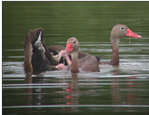
Black-bellied Whistling-Ducks, Logan Co. 5 August 2013 Frank Lyne