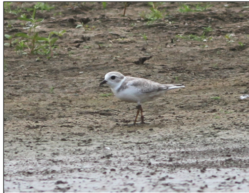
Piping Plover, Fulton Co. 11 September 2013 Brainard Palmer-Ball, Jr.