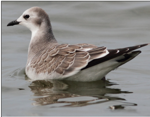
Sabine's Gull, Kentucky Lake 19 September 2013 Eddie Huber