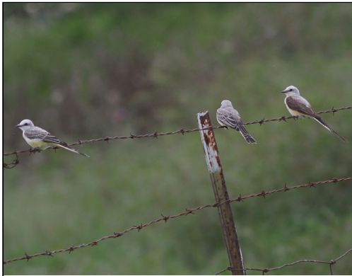
Scissor-tailed Flycatchers, Webster Co. 7 August 2013