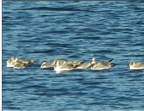
Franklin's Gulls, Lincoln Co. 9 November 2013