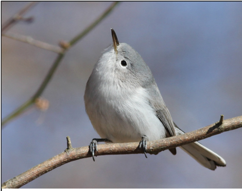
Blue-gray Gnatcatcher, Trigg Co. 29 November 2013 Brainard Palmer-Ball, Jr.