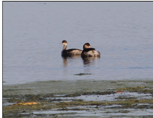
Eared Grebes, Union Co. 9 October 2013 Brainard Palmer-Ball, Jr.