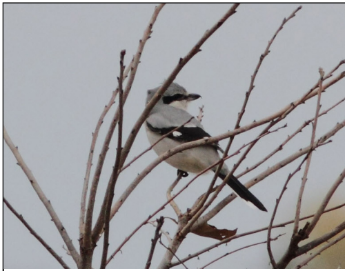
Northern Shrike, Union Co. 2 November 2013 Eddie Huber