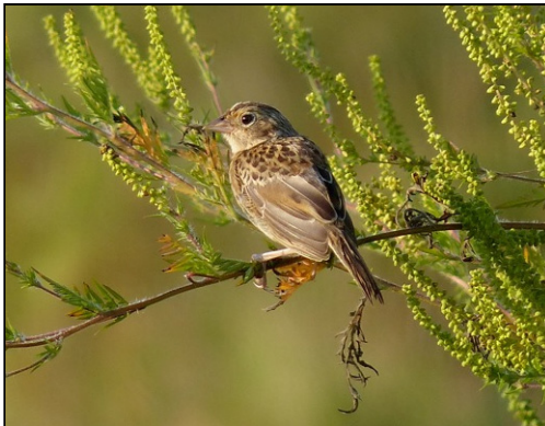
Grasshopper Sparrow (juv.), Henderson Co. 7 September 2013 Charlie Crawford