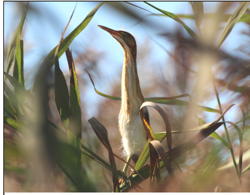
Least Bittern (juv.), Muhlenberg Co. 3 September 2013