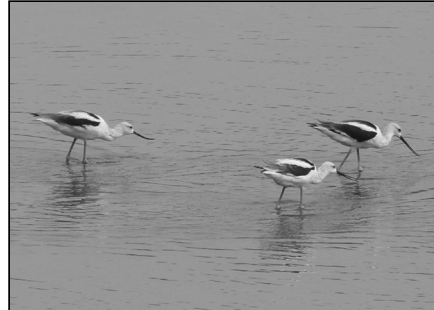
American Avocets, Jefferson 12 September 2013 Brainard Palmer-Ball, Jr.

American Avocet – there were four reports: 5 at the Falls of the Ohio 31 August (EHu, BP, et al.) with 1 there 9 September (PHt); 3 at Melco 12 September (ph. BP); and 1 on Ky Lake s. of Ky Dam Village 8 October (BP, EHu).