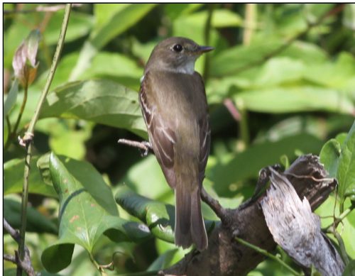
Alder Flycatcher, Fulton Co. 20 August 2013