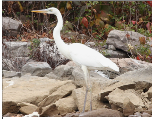
Great Blue Heron (white morph) Freeman Lake, 23 October 2013