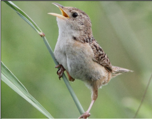
Sedge Wren, Union Co. 12 August 2013 Eddie Huber