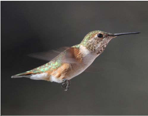
Rufous Hummingbird, Hart Co. 1 November 2013