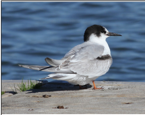
Common Tern, Hardin Co. 8 November 2013