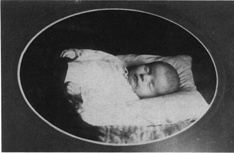
“Particularly in the case of a deceased child, no visual remembrance might exist without the postmortem photograph.” Memorial photograph of unidentified child, ca. 1880.