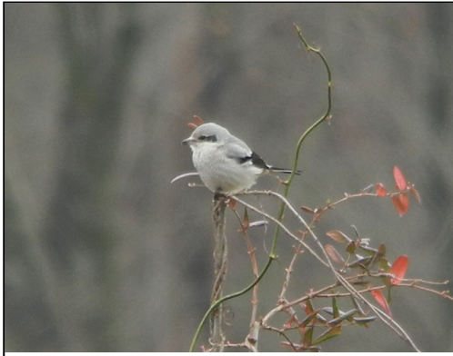
Northern Shrike, Russell 14 January 2013 Roseanna Denton