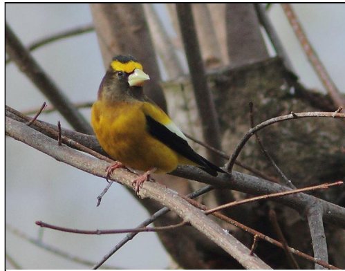
Evening Grosbeak, Morgan 19 February 2013