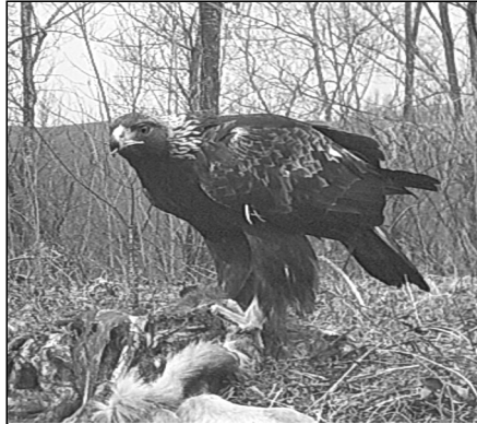
Golden Eagle, Pike 28 January 2013 Ky. Dept. of Fish and Wildlife Resources

Great Egret – there were two reports of lingering birds: 1 at the Falls of the Ohio that continued from the fall season to 16 December (TBe, CBe, et al.) and 1 at the Jacobs Creek impoundments, Paradise Power Plant, Muhlenberg , 30 December (SG, TG, †BP).