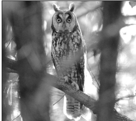
Long-eared Owl, Union 24 February 2013 Eddie Huber

Long-eared Owl – there were four reports: 1 at the Sinclair Unit 4 December (ph. JSo); 1 n. of Red Hill, w. Allen , 29 December–26 January (†TBr, AB, JBr, JH); 2 at the Wendell Ford Training Center 18 February (BP, ph. EHu, ph. MYa) and 3 at Camp #11 on 24 February (BP, ph. EHu).