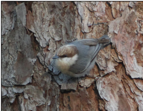
Brown-headed Nuthatch, Marshall 18 January 2013