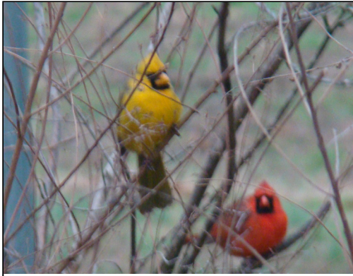
Northern Cardinal (yellow variant), Calloway 10 January 2013 Tony Black