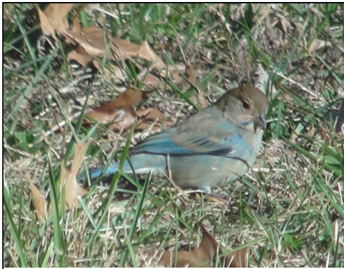
Indigo Bunting, Daviess 12 December 2012