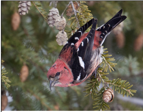
White-winged Crossbill, Lexington 23 January 2013 Pam Spaulding