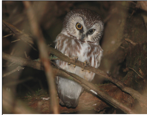
Northern Saw-whet Owl, Madison 7 December 2012