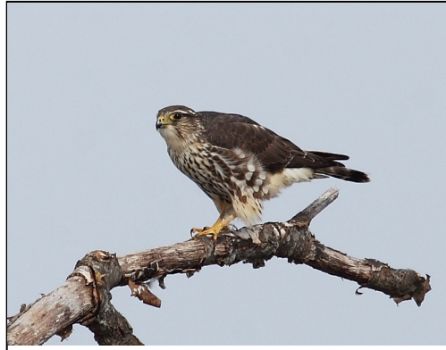
Merlin, Oldham 2 February 2013