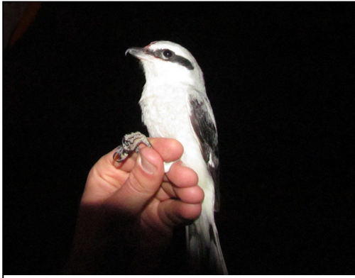
Northern Shrike, Ohio 16 February 2013 Alex Fish