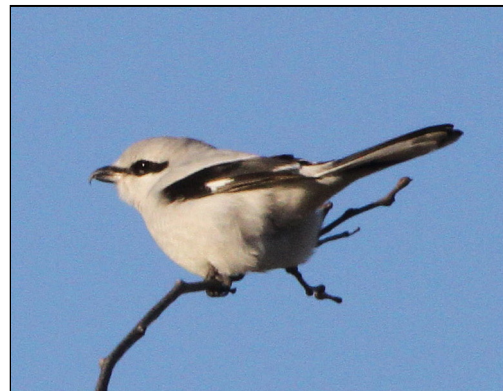
Northern Shrike, Muhlenberg 23 January 2013