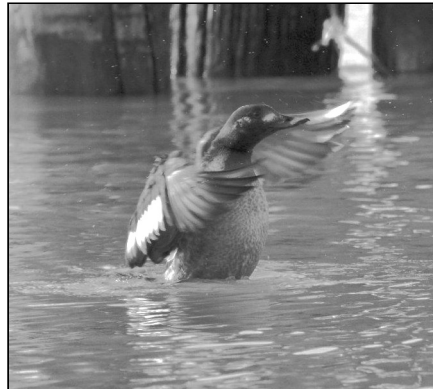
White-winged Scoter, Louisville 20 February 2013 Eddie Huber

White-winged Scoter – there were five reports: a female/imm. on the Ohio River at Louisville 16 December (CBe, ph. TBe, et al.); a male on Cave Run Lake, Bath , 5 February (ph. JPk); a female/imm. above Meldahl Dam 9 February (JFr, LHo); a female on the Ohio River at Louisville 16 February into March (MA, ph. EHu, et al.); and an imm. male on Cave Run Lake 23 February (JSo, MSt, ph. BP).