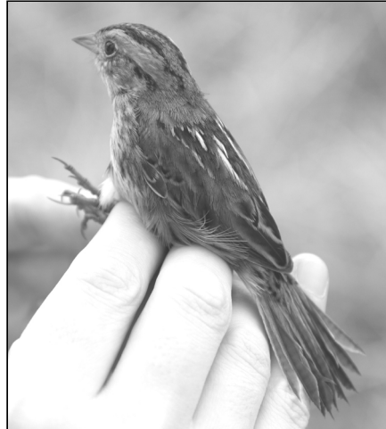
Nelson's Sparrow, Jefferson 16 December 2012