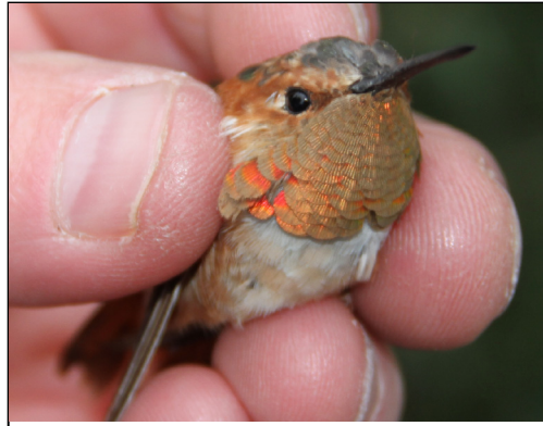
Rufous Hummingbird, Franklin 21 December 2012