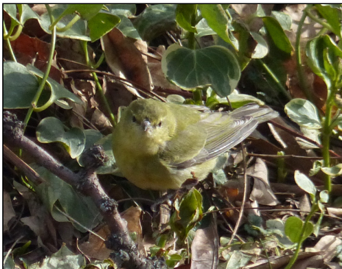
Tennessee Warbler, Louisville 2 February 2013 Steve Deetsch