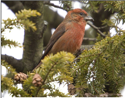
Red Crossbill, Louisville 27 January 2013 Pam Spaulding