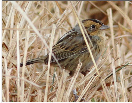
Nelson's Sparrow, Jefferson 19 April 2013