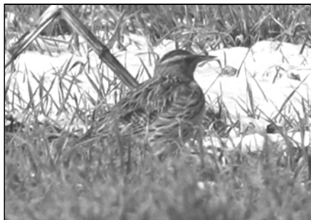
Western Meadowlark, Ballard 3 January 2013 Brainard Palmer-Ball, Jr.

Western Meadowlark – there were reports from three locales: 1 se. of Needmore, Ballard , 3 January (ph. BP, EHu); 1 singing sw. of Cayce, Fulton , 17 January (†BP, EHu) with 10 in the same area 29 January (RD); and 1 at Open Pond, Fulton , 17 January (BP, ph. EHu).