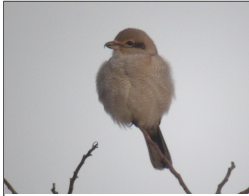
Northern Shrike, Ohio 30 December 2012 Ben Yandell