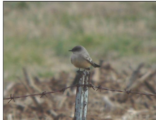
Say's Phoebe, Calloway 6 January 2013 Eddie Huber