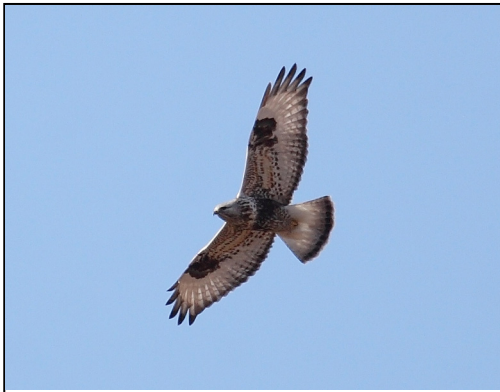
Rough-legged Hawk, Muhlenberg 23 January 2013