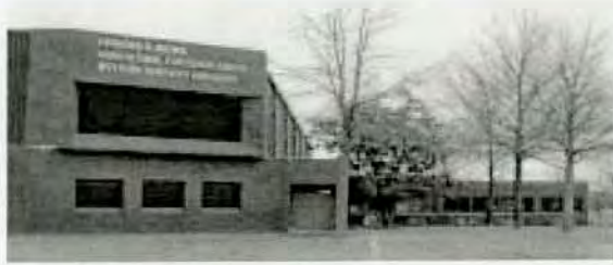
Ag Expo Center

Statistics concerning the occurrence at the Ag Expo Center , and during the most recent calendar year, and during the three preceding calendar years for which data are available, of the following criminal offenses reported to campus security authorities of local police agencies: