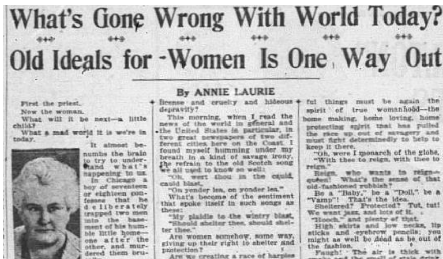
Figure 2: Annie Laurie, "What's Gone Wrong with World Today?" San Francisco Examiner , Sept. 13, 1921: 3.