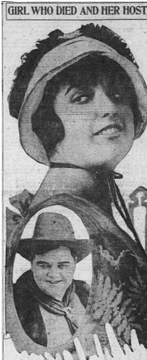
Figure 4: "Girl Who Died and Her Host," San Francisco Examiner , September 10, 1921: 1.