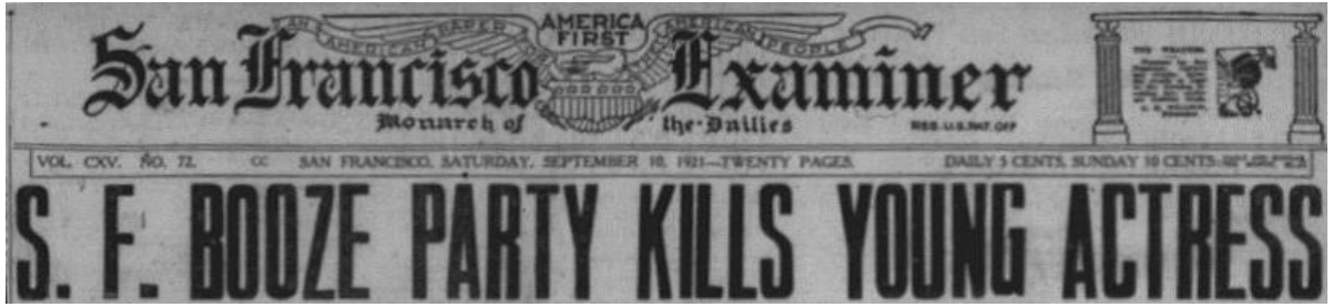
Figure 3: "S.F. Booze Party Kills Young Actress," San Francisco Examiner , September 10, 1921: 1.