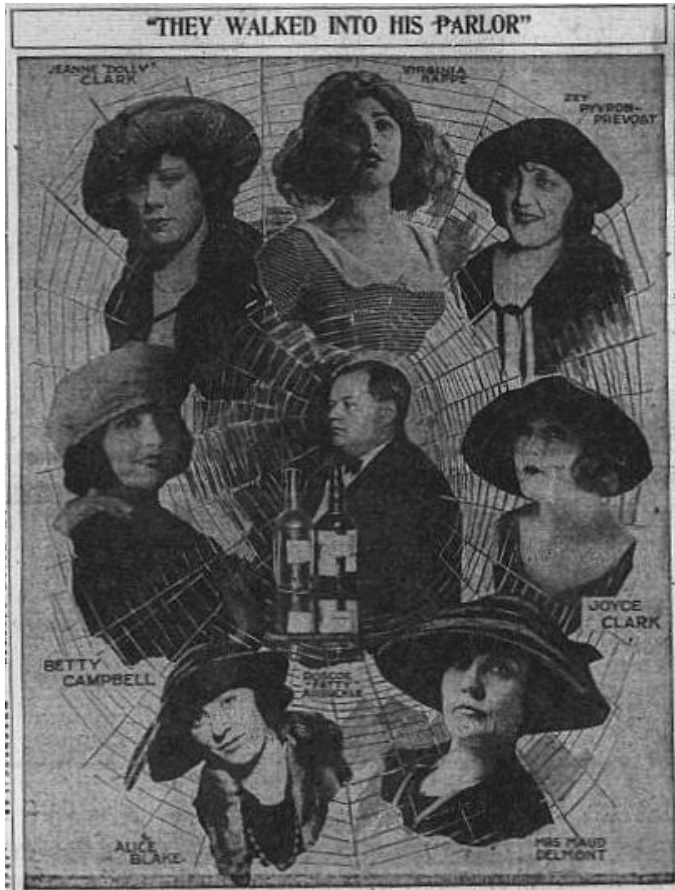
Figure 1: "They Walked into His Parlor," San Francisco Examiner , September 15, 1921: 1.