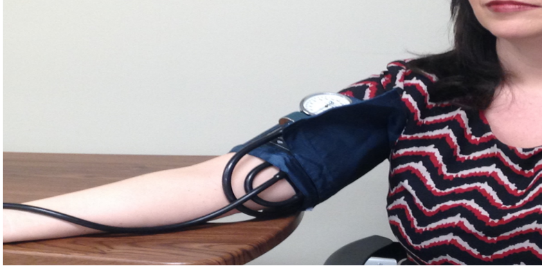
Figure 1. Correct arm placement for blood pressure measurement.