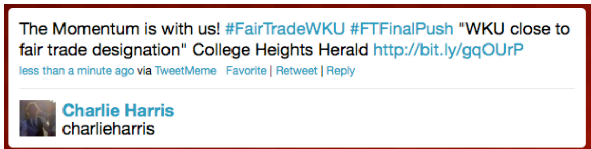
Figure 2 Example Tweet

Taking these analytics and using the power of Twitter Search , you can begin to find the story behind the actions of your movement. As I said before, the narrative to any movement is important, and with live-on-the-scene information, this history becomes more concrete. Other users start noticing the conversation and actions being taken, want to take part, and your movement grows.