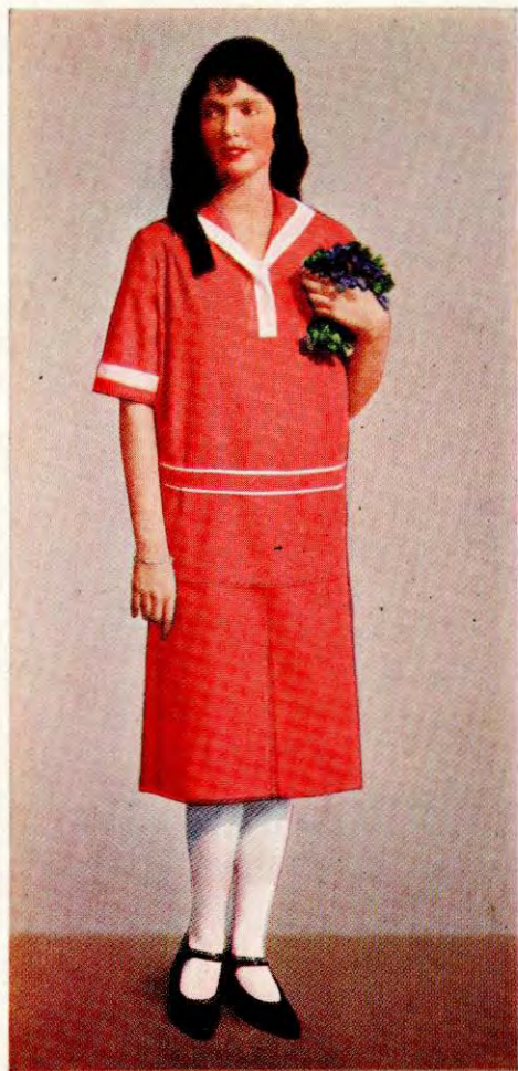
"The Typical American Girl" (See description on preceding page)