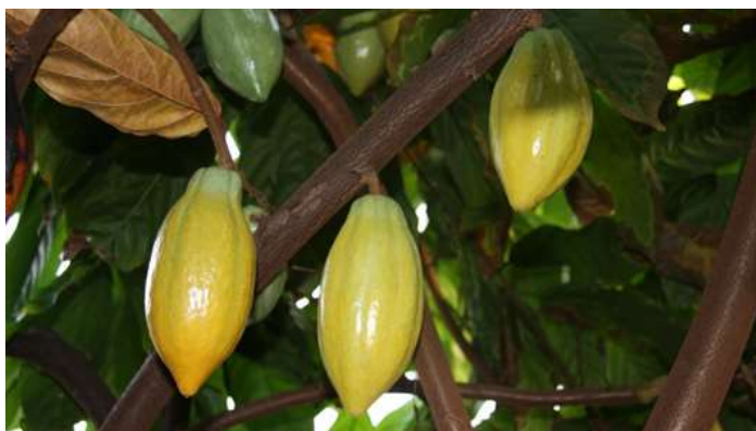
Figure 3.6: Theobroma cacao (Cocoa)

Cocoa ( Theobroma cacao ), shown in Figure 3.6, was valued as another aphrodisiac by the Aztecs. It was also used in the treatment of dysentery, as a