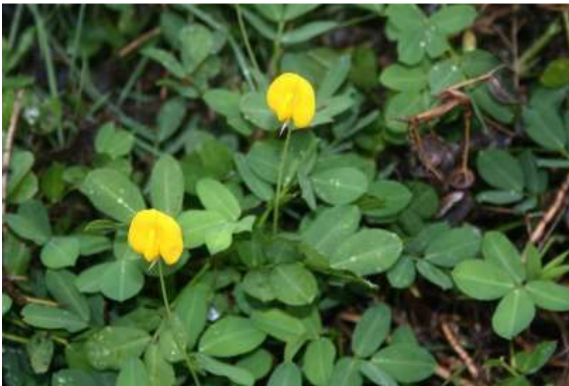
Figure 3.5: Arachis hypogaea (Peanut)

Although we think of it as little more than a food source today, the common peanut, Arachis hypogaea , (Figure 3.5) was a widely used herb in Aztec culture. The leaf, the seed (nut) portion of the plant, and the oil were useful, and could relieve a