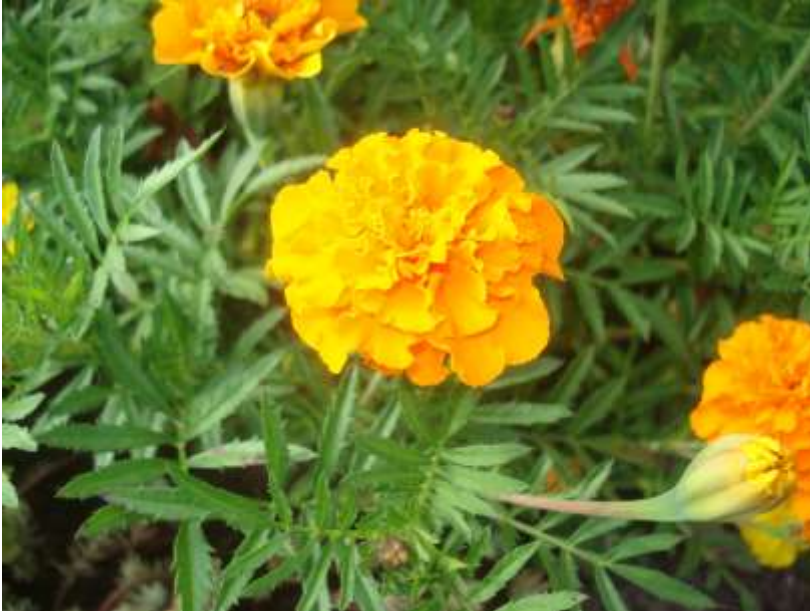
Figure 3.2: Tagetes erecta (Marigold)

In addition to being a source of antioxidants, the marigold contains a