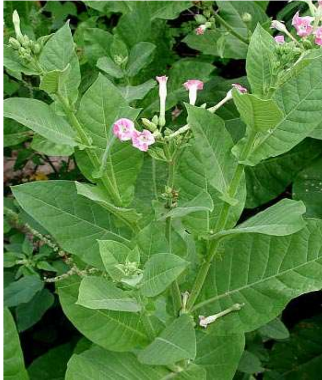
Figure 3.3: Nicotiana tabacum (Tobacco)

It is interesting to note that, although the leaves are the active part of the plant, the method of administration was almost never smoking. Typically, tobacco was infused with other herbs and administered orally in