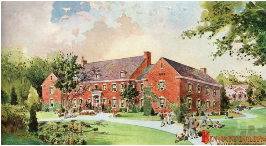
Built in 1939, the Kentucky Building is home to the library, archives, and museum collections.

Our diverse collections prior to our use of the collection management software program, PastPerfect, were hidden virtually and accessed using analog card files and finding aids, which often limited their use to in-house researchers. There was an OPAC with its access for books and periodicals and some collection-level records for manuscript and university archives. However, museum objects, photographs, and folklife archives, as well as other non-book items were accessed only through paper finding aids or the memory of a long-time staffer.