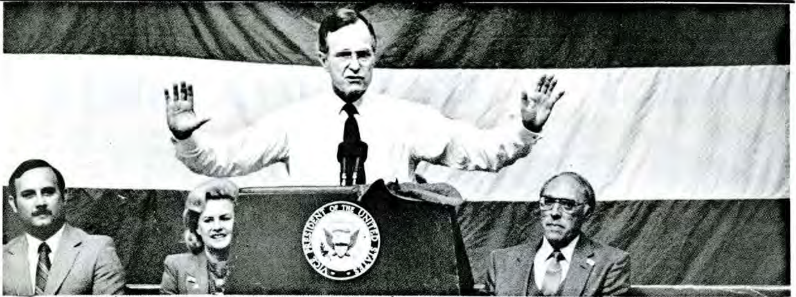
Vice President George Bush gave the "form letter" campaign speech at Western last October in Diddle Arena.