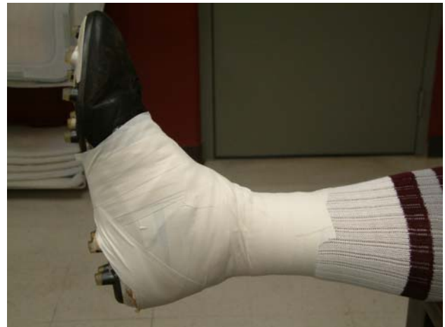
Figure 1. Photograph of the spating technique used.

study, goniometric measurement of PF and inversion was taken three times by the same examiner (a certified athletic trainer); however, a second examiner (also a certified athletic trainer) read and recorded the measurement in an effort to "blind" the investigator operating the goniometer. Average scores of the three trials were determined and used for both summary and inferential statistics. To evaluate test-retest measurement efficacy for our data, differences between trials were examined with univariate analysis of variance (ANOVA) with repeated measures along with average measures ICC using a two-way fixed effects model, as recommended by Weir (37).