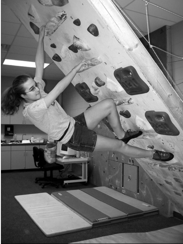
Figure 2. The 45-degree HITTM Strip climbing board and the primary move used in this study.

the medial epicondyle of the humerus to the styloid process of the radius and a second electrode two cm distal along the same line according to Davies (3). A ground electrode was affixed at the olecranon process. Impedance between electrodes was tested and verified at below 5000\Omega . All raw EMG data were recorded at 500 Hz using a Tel-100 system (Biopac Systems, Inc.) and laptop microcomputer. The raw EMG signals were integrated via root mean squared (RMS) over 50 samples and peak values subsequently determined via Acqknowledge version 3.5.6 software (Biopac Systems, Inc.).