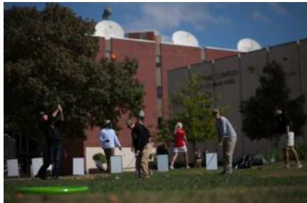
WKU's golf expo was held Oct. 9 on the South Lawn.