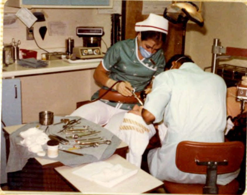
"A little more suction."