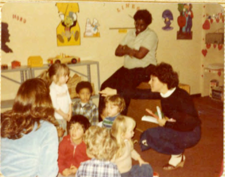
Do you know how to brush?