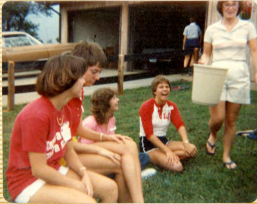
What's so funny?