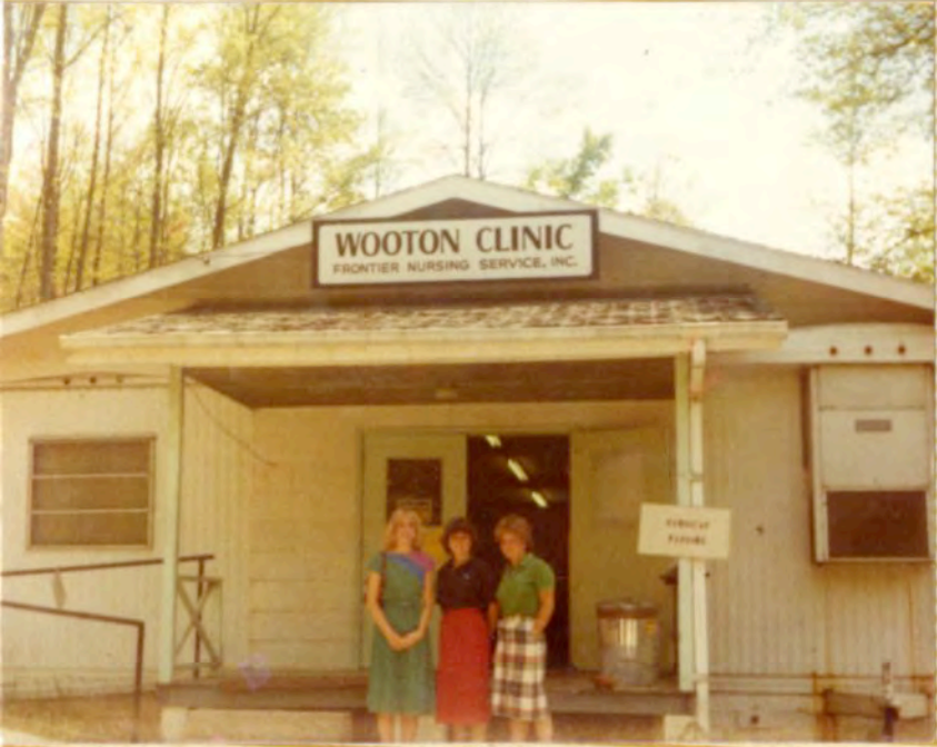
Down in the Boondocks!