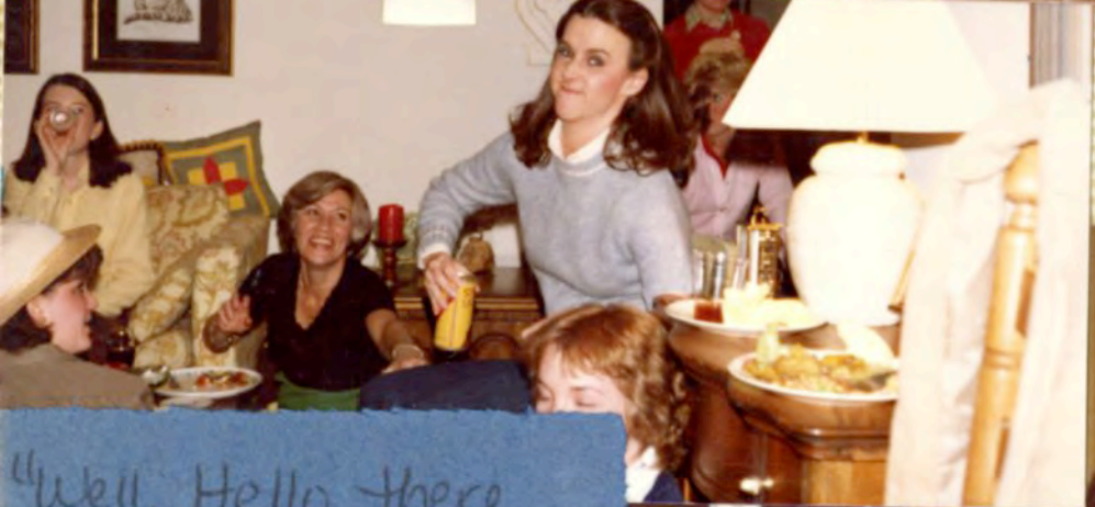
"Well, Hello there Mr. Coyote.."