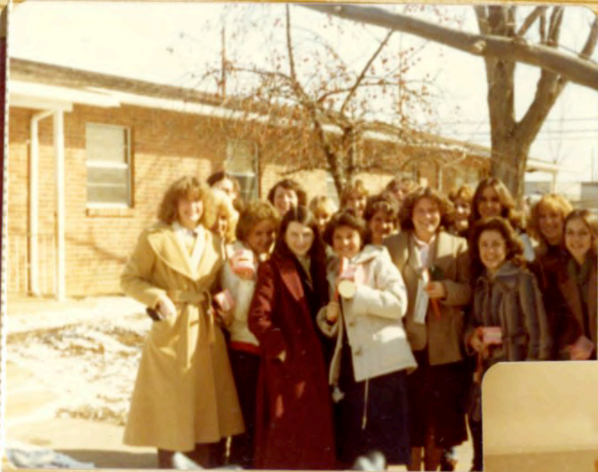
One of our Many Roadtrips?