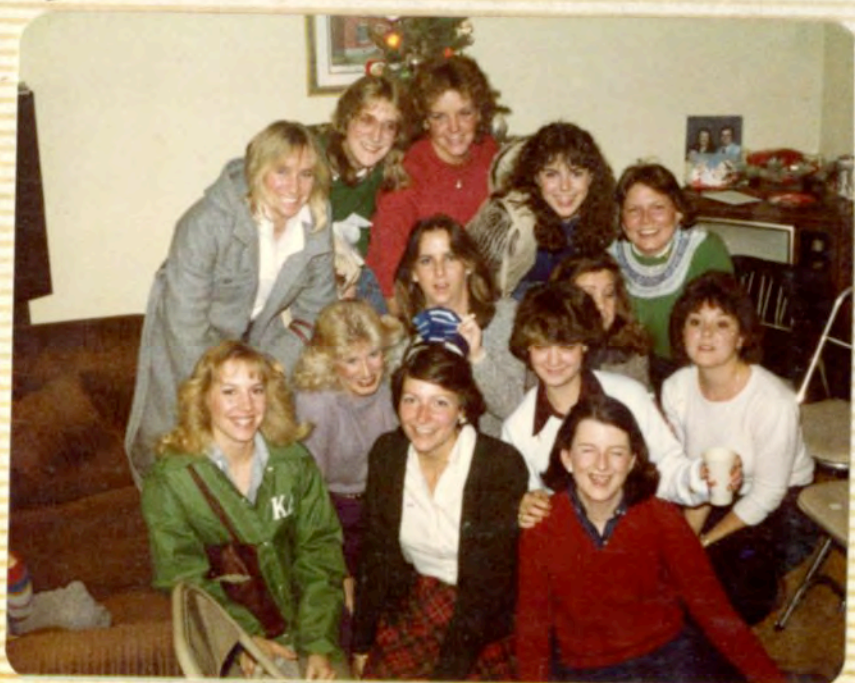
The Class of '82