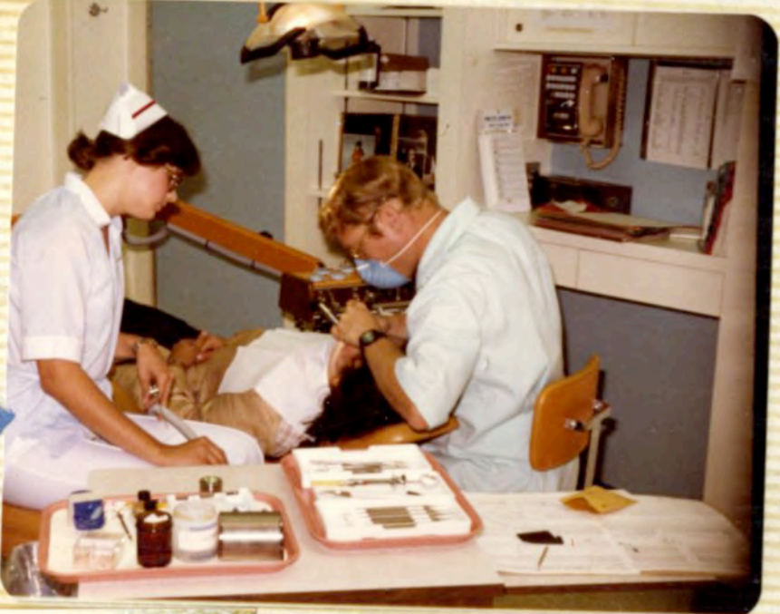
"You might be interested in this."