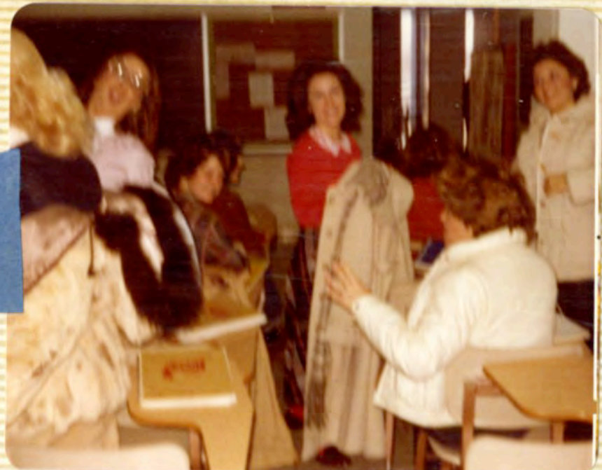
Class time Confusion