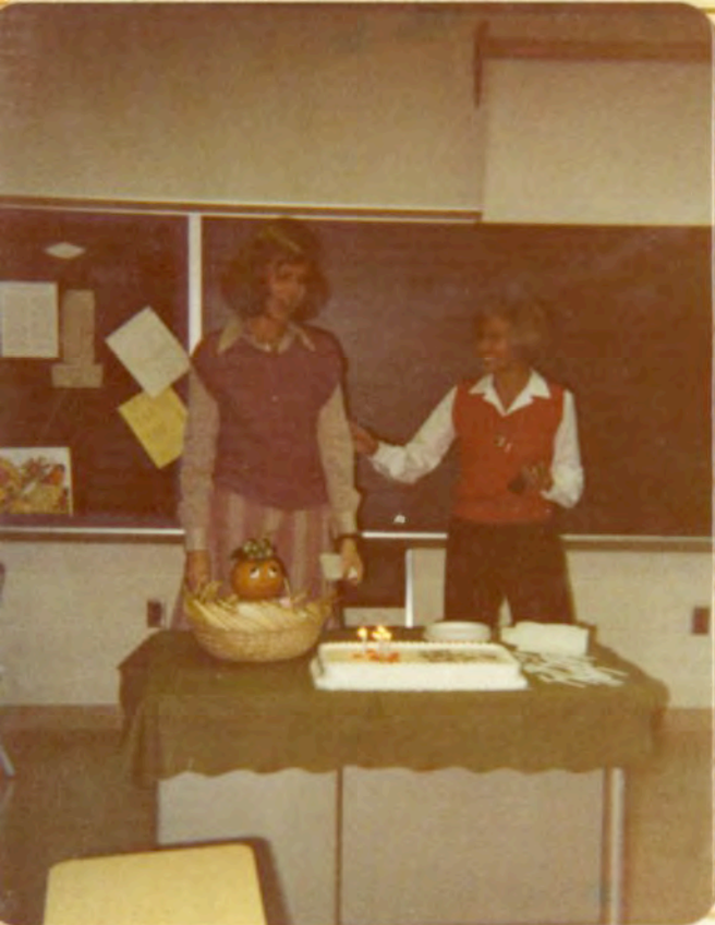
Happy Birthday to Cox