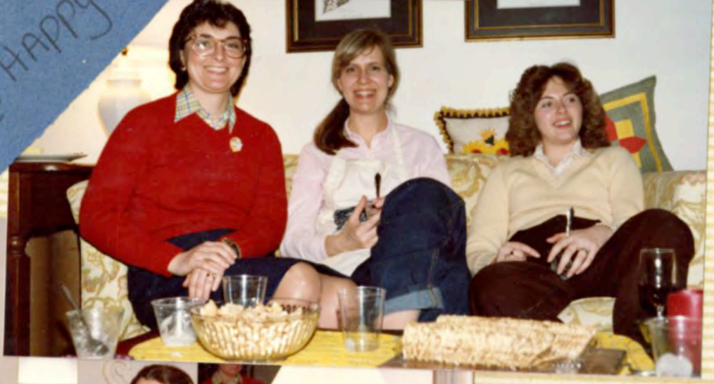
We're 50 Happy!