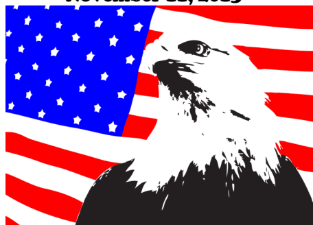
Veterans Day & Remembrance Day

system to take advantage of the world-class care we provide to the men and women who have served this Nation in uniform,” Shinseki added.