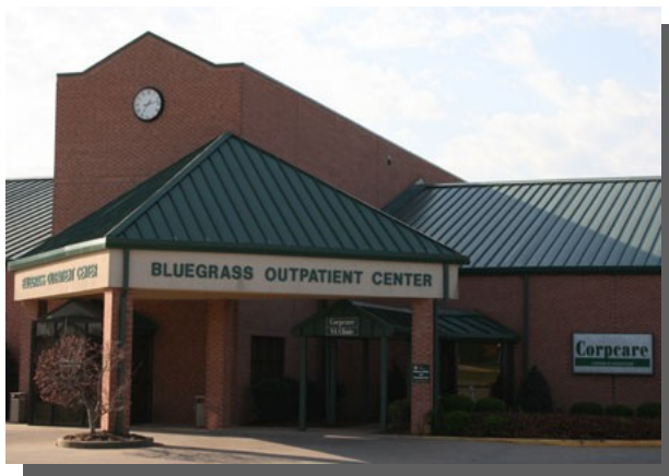
Bowling Green's VA Primary Care facility, Corpcare , 1110 Wilkinson Trace.

The sooner you can become a participant the sooner you can benefit from health care services that you have rightfully earned as a veteran in service to your country.