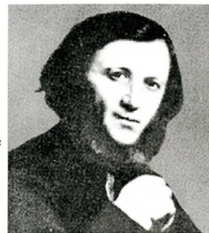
The Browning Literary Club was formed in 1895 to study the poetry of Robert Browning.