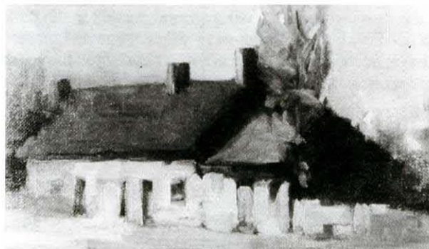
"Slave Quarters on Eighth Street" by Frances Herrick Fowler, oil on canvas, ca. 1910, from The Kentucky Museum Collection.

From there, the original project evolved into a collaborative venture with the staff of the Owensboro Museum of