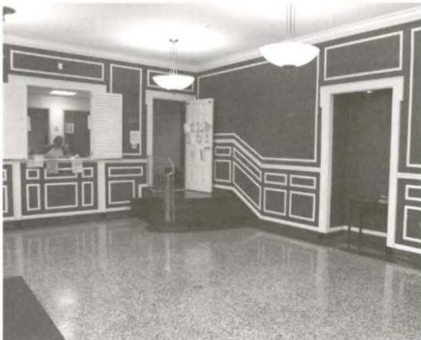
The newly remodeled lobby of McLean Hall.