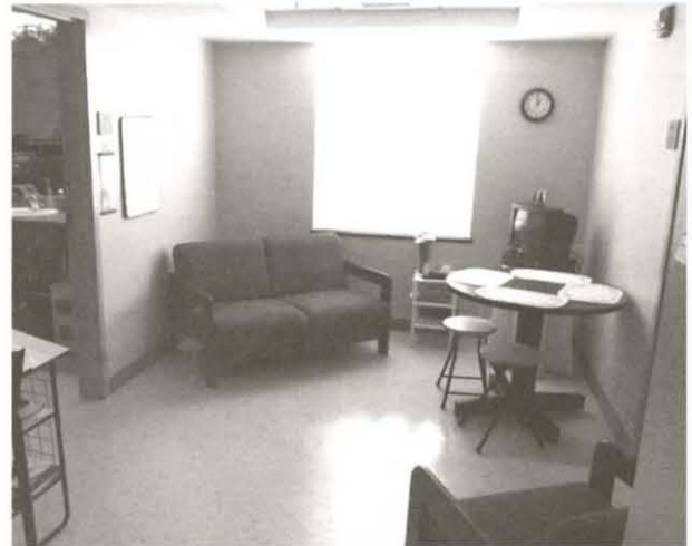
At the end of each hall, the rooms are connected by a living room suite. There are two suites per floor.