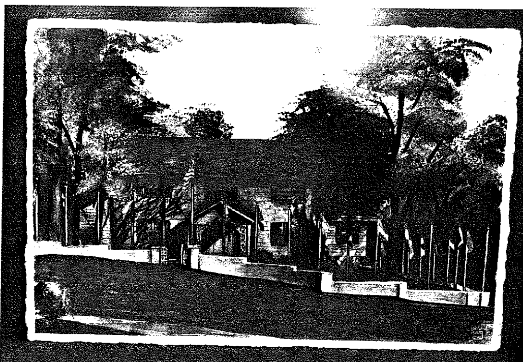
After renovations, the International Center will fly proudly the flags from 24 different nations that are representative of WKU's international student population.

"We're sprucing up the International Center to make it more functional for activities and make it look and feel more international," he said.