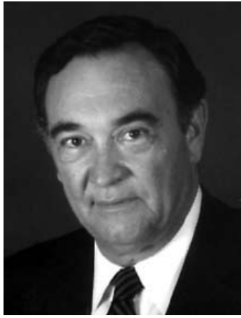
The late Gov. Louis B. Nunn

Teachers will be nominated and recommended by their individual school districts and fellow teachers. A set of selection criteria has been created by a committee of Western faculty, P-12 teachers and administrators, and representatives from various state professional organizations. Inductees will be selected by a representative committee of professionals and will automatically