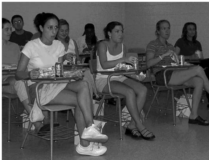
REU interns enjoy their lunch while attending a Brown Bag Seminar