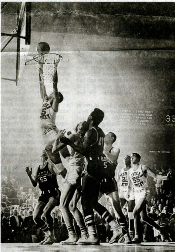
THE DAILY NEWS