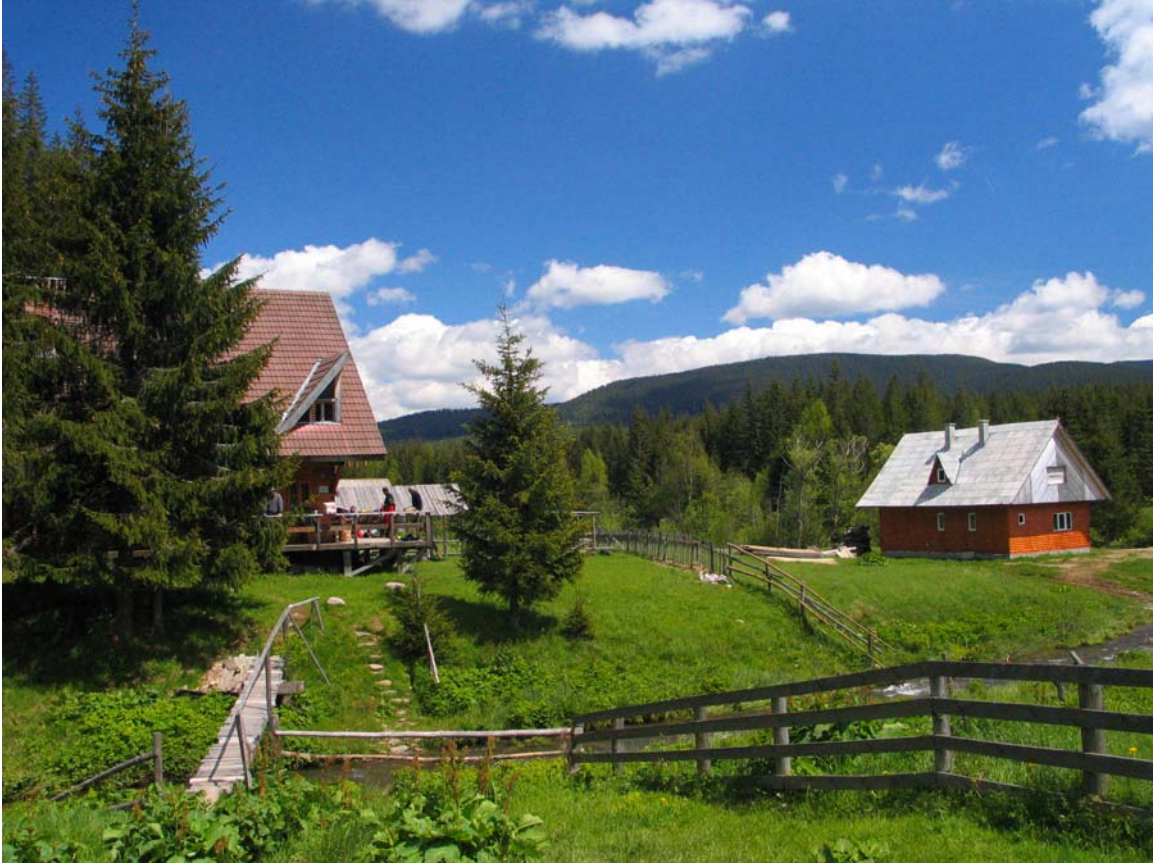
Speleo hut at Ic Ponor in the Apuseni Mountains