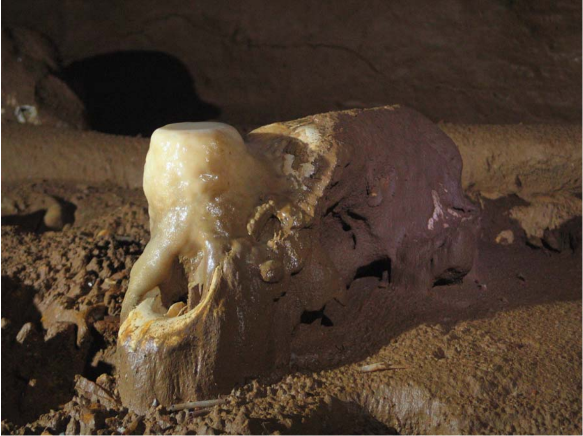
Stalagmite growing on top of an Ursus spelaeus skull in Peștera Ursilor – Lee Florea.