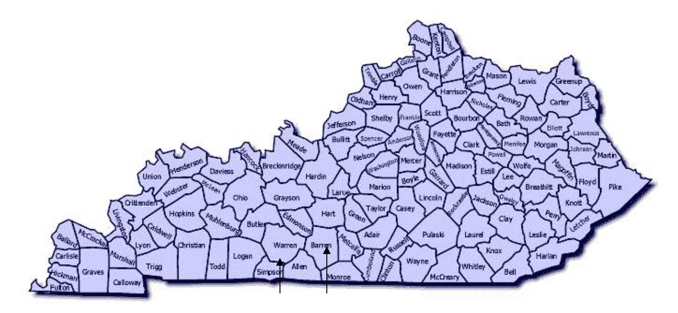
Figure 2 . Map showing the counties of Kentucky. Warren and Barren Counties are indicated by arrows.