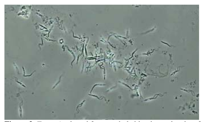
Figure 3 . T. cruzi cultured from a whole blood sample taken from raccoon, RW10.

A total of 17 isolates of T. cruzi were successfully established by hemoculture of whole blood from raccoons in complete LIT medium. The length of incubation time between the initiation of the hemocultures and the first appearance of epimastigote stages of the parasite ranged from two to six weeks. Figure 3 shows epimastigote stages present in one of the positive hemocultures (RW10).