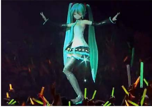
Figure 1: Miku the singing, digital avatar. © SEGA http://miku.sega.jp/ . © Crypton Future Media, Inc. © SONY Music Lable. [4].

Miku pranced around several stadium stages as part of a concert tour, where the capacity crowds waved their glow sticks and sang along 2009" [4].