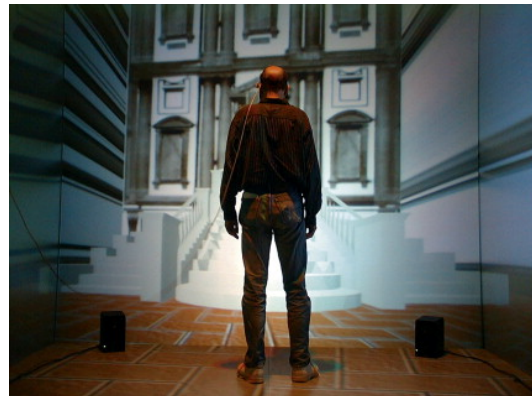
Figure 3. A CAVE Visual Display

three screen walls, a roof screen and a floor screen. The user can move in the three-square meters space. This immersive environment is commonly equipped with motion tracking.