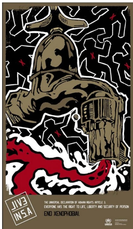
Figure 4 Student (B). Untitled Digital print. Size A4. 2008