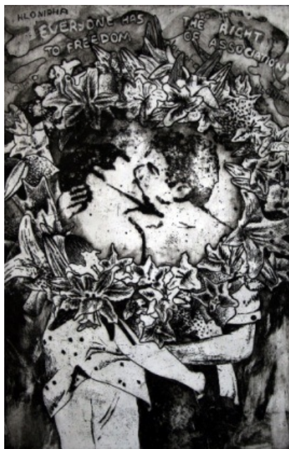
Figure 3 Student (C). Second Year: Etching. Untitled. Size A4. 2009

The second-year printmaking module of the Visual Graphics course comprises a series of five projects over the year that aim to engender a critical sense of social responsibility. The third example (Student C) referred to in this article is an etching project based on an Introduction of the Civic Learning Spiral. The theme explores an aspect of social justice which introduces notions of civic engagement in the education process.