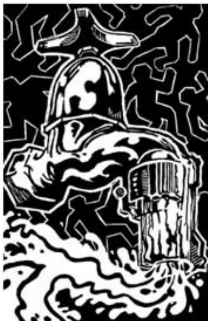
Figure 2 Student (B) Untitled Linocut print. Size A4. 2006

material wealth and discriminatory treatment by society. His journey to and from the university was educational, in the sense that he became aware of the lack of human rights practice among the people who mattered. In his first graphic print based on Article Twenty Four of the Bill of Rights, that is, 'Environment' (Republic of South Africa, 1996:24), Student A explained that this image was as much about social inequity as it was about the environment. In his print (Figure 1), the symbolism is two-fold; firstly, the upper composition depicts the environmental effects of industrialization and globalization, that is, the way in which technological advances in industry and global communications pay scant regard to their effect on the environment. The image addresses the danger of rampant pollution in a fragile natural world, symbolized by the brittleness of an animated tree. Student A juxtaposes technology with poverty symbolized by the group of urban dwellers, which he based in the township of Soweto. The composition addresses the sharp distinction between the level of historical disenfranchisement that contrasts an image of urban poor people against the economic advantage of a growing technology and communications sector.