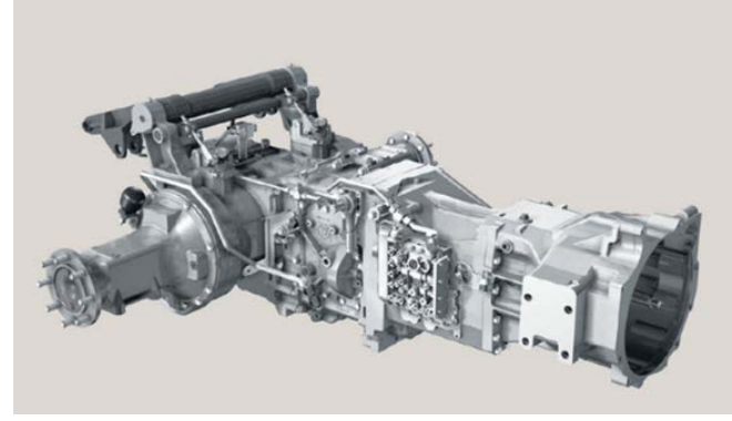
Fig. 1 ZF Synchromesh Transmission T500 -T600 series

Against the design criteria specified above, such transaxle is expected to be highly reliable and to have a more strict maintenance schedule. The cost of a transaxle may be slightly higher than the price of every component sourced and purchased separately. Apart for regular maintenance no repairs can be done on the site since it is so compact and almost half of the vehicle has to be disassembled in order to get to the defective part of the