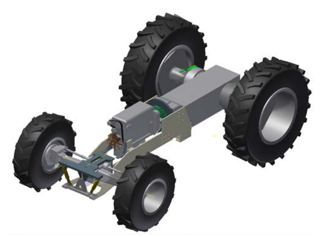
Fig. 4 3D model of the tractor

As the integration of the main components have been completed, the final layout of the model is shown in Fig. 5 and overall dimensions summarized in Table III.