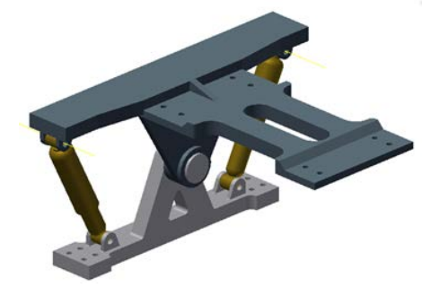
Fig. 3 3D Models of the front suspension assembly

The front suspension have been designed as a three link type with a swivel bracket that has a pivot point and on each side, mountings for the shock absorbers as shown in Fig. 3.