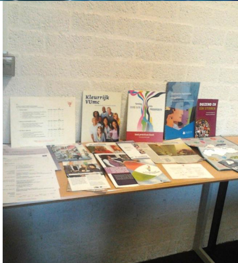
A collection of methods and tools that aim to enhance SKC recognition and management of cultural diversity within organisations.

This significantly lowers the number of vacancies available to TCNs, given that 82 per cent of them have a lower or intermediate education (Statistics Netherlands, 2014). Apart from legal obstacles, TCNs face more social and linguistic challenges connected to being foreigner in the Netherlands, which have to do with organisation cultures and negative or stereotypical perceptions of HR and other staff (see for example Van den Broek, 2014). Lastly, as a result of the current tight labour market, approximately one third of young native Dutch in the beginning of their career currently settle for jobs for which they are overqualified (Berkhout et al., 2012).