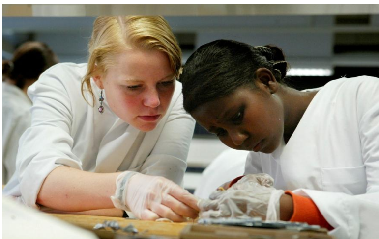
Shortages are likely to remain in sectors such as health care, primary and secondary education, horticulture and in the manufacturing sector.

The Dutch Refugee Council (Vluchtelingenwerk Nederland) gives practical support to refugees during their