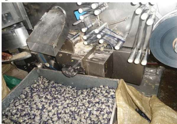
Fig 2 Typical automated manufacturing sweet wrapping machine

In view of the low level TQM standards, the main thrust of TPM trainers' early work involved improvements to routine maintenance and work practices. They worked with elected individual production teams to identify all areas of the machines that had to be lubricated, cleaned, adjusted or otherwise regularly maintained. A picture of a clean and well-maintained machine is shown in Fig 2 below.