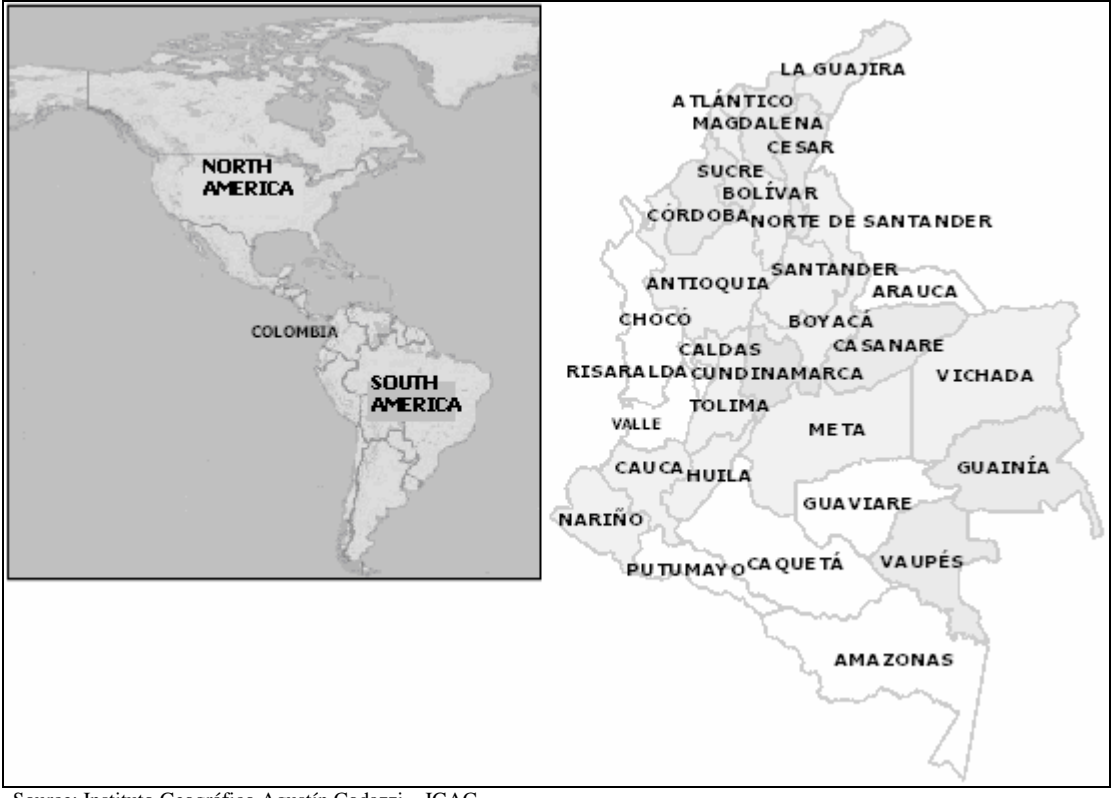
Figure 1. Colombia and its departments