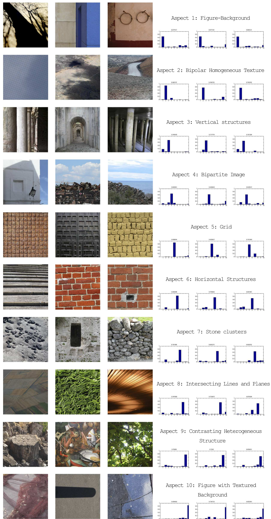
Fig. 3. Images and histogram of aspects obtained on the set of high entropy images.