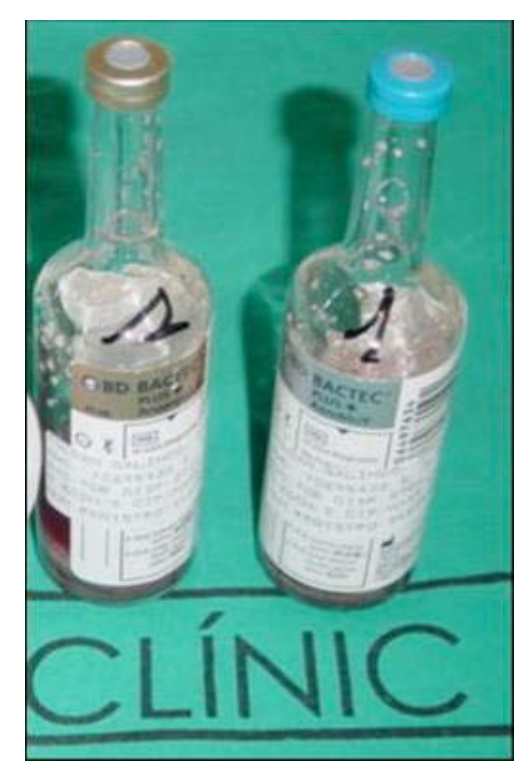
Fig. (5). Blood culture bottle with medium.

Next, arthrotomy and synovectomy of the quadricipital pouch and lateral recesses are carried out, along with removal of all the sphacelous intra-articular tissue that shows signs of infection (Fig. 6).