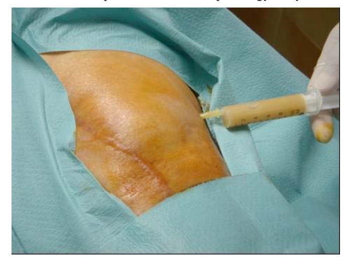
Fig. (2). An Arthrocenthesis with pus.

➤ 5 neutrophils / 5 fields in the pathology study