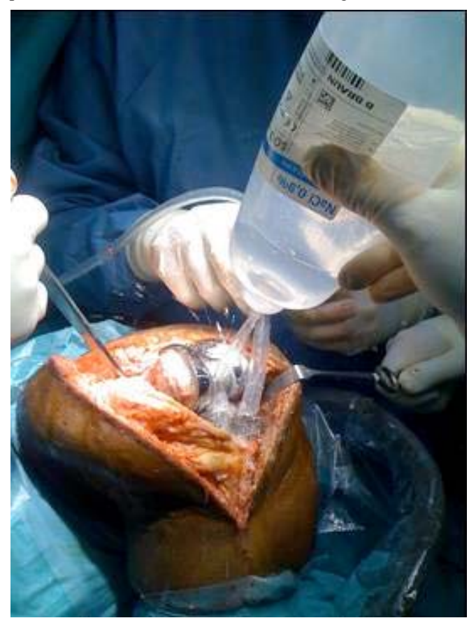
Fig. (7). Irrigation with 9 litres of saline solution, performed just after synovectomy.

the results of the microbiological cultures obtained during the surgery [17]. Following debridement, lavage irrigation is performed with 9 litres of saline solution (Fig. 7).