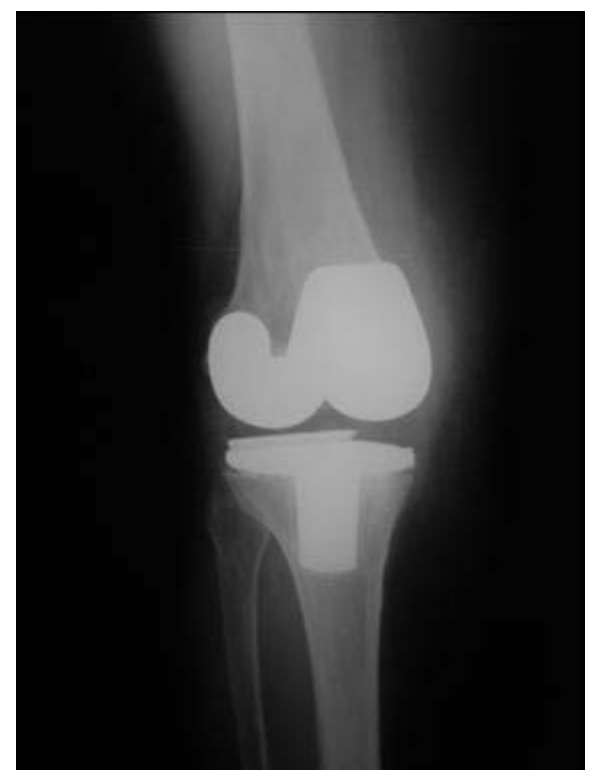
Fig. (1). 87-year-old patient with an acute haematogenous infection caused by Listeria monocytogenes. The radiolucent lines can be observed around the tibial component.

is well-aligned, which is helpful towards bringing into focus the surgical treatment that will later be required. In acute haematogenous infections radiological images are more useful, especially in cases where the prosthesis has been in place for a long period of time. In these cases, radiolucent lines can appear that bring into question the stability of the implant, and can be helpful towards determining the surgical treatment to be carried out (Fig. 1).