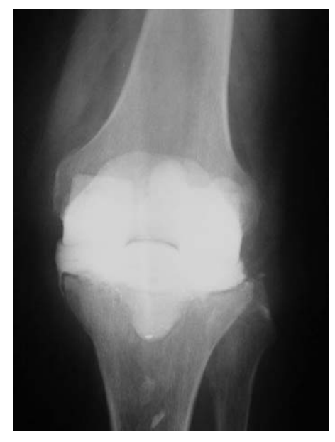
Fig. (3). Anteroposterior X-ray of the joint spacer.

The surgical treatment for a chronic prosthetic knee infection has been perfectly defined and standardized, and consists in a two-stage implant revision process [16]. In the first surgical stage, the prosthesis is extracted and an attempt is made to conserve the largest amount of bone stock as possible. Next, an exhaustive surgical cleaning is carried out, removing all sphacelous tissue or tissue that is suspected of being infected. Finally, an antibiotic-loaded cement spacer is implanted (Figs. 3, 4).