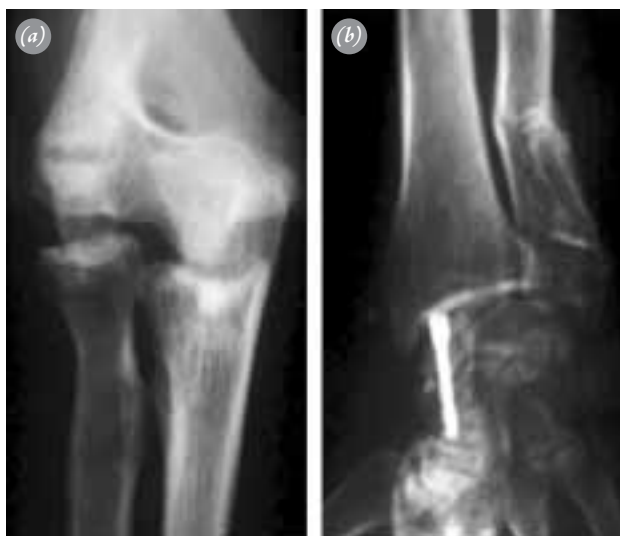
Fig. 2. Radiographic changes after removal of hardware. (a) Condylar deformity and proximal migration of the radius with proximal radioulnar dislocation. (b) Malaligned consolidation of the ulna and radioulnar discrepancy due to radius ascension.