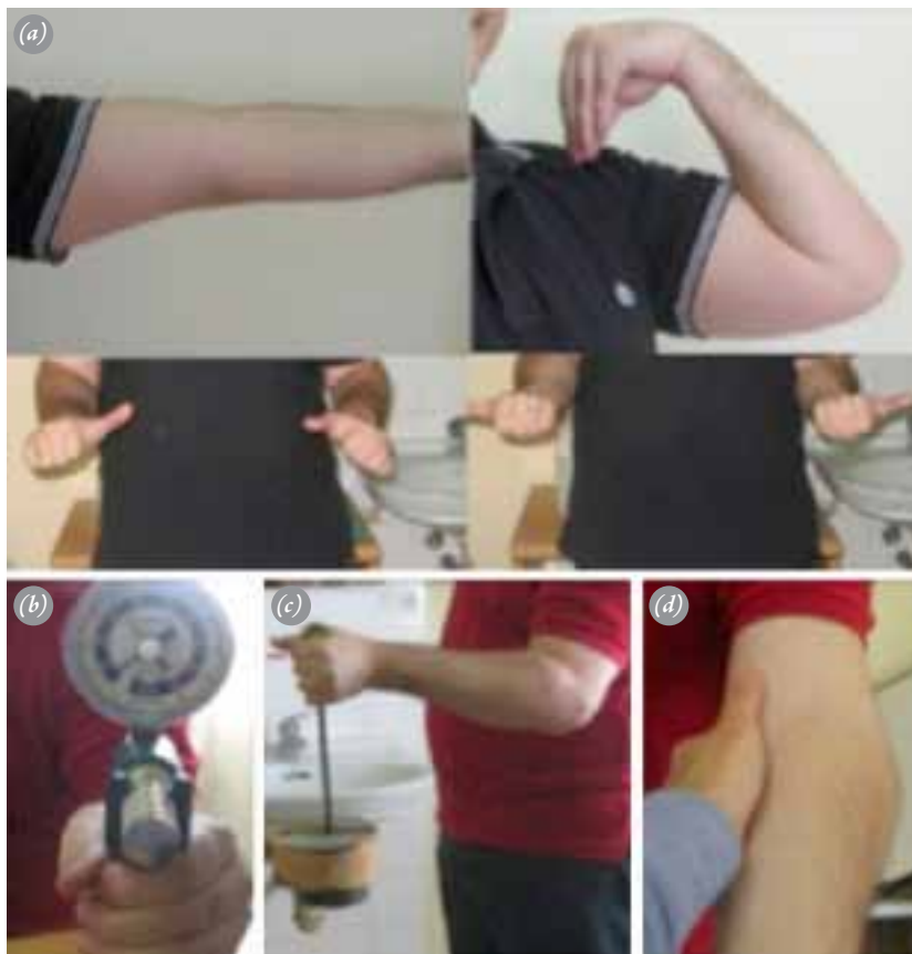
Fig. 4. Two years follow-up functional outcome. (a) Range of motion: the patient reached complete extension and 120° of elbow flexion. The pronation-supination arc was close to normal. (b) Grip strength of the affected hand reached 35 kg. (c) The patient was able to lift 12 kg. (d) An asymptomatic moderate varus laxity was detected. [Color figure can be viewed in the online issue, which is available at www.aott.org.tr ]

flexo-extension elbow movement. Intentional pseudoarthroses at the neck of the radius and distal ulna allowed recovery of the pronation to supination arc.