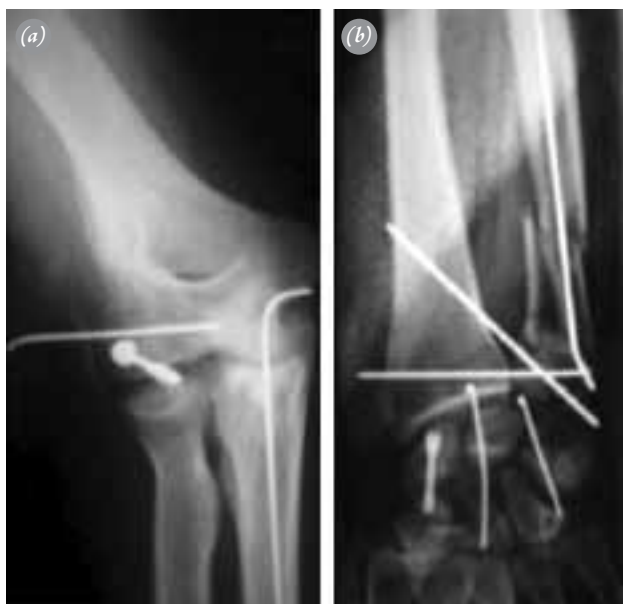
Fig. 1. Radiographic study of left elbow and wrist at 6 weeks after the accident at the first consultation in our center. (a) Humeral condyle fracture was treated by unorthodox internal fixation using spongy screw of 4.0 mm and Kirschner wire. (b) Wrist radiography, showing fracture-dislocation of distal ulna treated with intramedullar Kirschner wire osteosynthesis and distal radioulnar joint transfixion, and Kirschner wire and Herbert screw fixation of transscaphoid-perilunate dislocation of the carpus.

A new radiographic study showed deformity of the humeral condyle and proximal migration of the radius, with proximal and distal radioulnar dislocation at the affected forearm (Fig. 2 a and b). A CT-scan confirmed these findings, but no useful additional information could be obtained without 3D reconstruction. A chronic disruption of IOM and atypical longitudinal radioulnar dissociation was suspected. The patient had a 45° loss of elbow extension, a maximal flexion of 95°, and global pronation-supination range of motion of 60°.