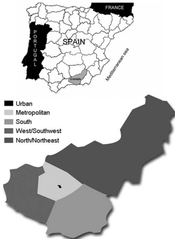
Figure 1. Upper map, geographic situation of the study population (Granada province) in Spain; lower, distribution of geographic areas in Granada province for the seroprevalence study of anti-Toscana virus immunoglobulin G antibodies.

Phlebotomines were introduced in vials with sterile crystal beads and 0.5 mL minimal essential medium supplemented with 20% fetal bovine serum and antimicrobial mix (0.4 mg/mL gentamicin, 0.5 mg/mL vancomycin, and 2.5 µg/mL amphotericin B). Vials were vortexed and centrifuged at 13,000 rpm for 5 min. A 200-µL aliquot of the supernatant was injected into tubes with African green monkey kidney cells; the remaining supernatant was frozen at -80°C. The pellet with the phlebotomines was used for RT-PCR. Tube cultures were incubated at 37°C and examined daily for the appearance of cytopathic effect (CPE). Tubes with positive CPE were tested for TOSV by RT-PCR.