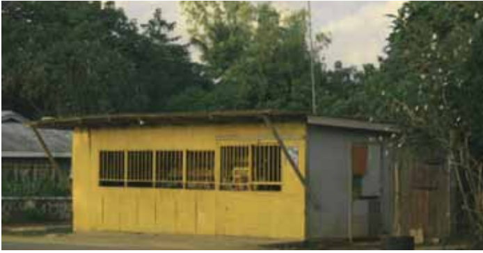
Figure 4: A fale koloa, now operated by Chinese, stands out the front of a timber framed house, Sepesi house, Tatakam tonga village, Tongatapu Island, 'Ilaiu Talei, February 2013.