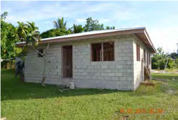
Figure 2: A house constructed by toli wages and completed with reciprocity and gifted labour by family members. Alikī house, Tatakam tonga village, Tongatapu Island, ‘Ilaiu Talei, February 2013.

seven houses are built from a variety of timber framed combinations, the most common type has weatherboard cladding, corrugated metal roof and on concrete piles. Similarly another type with fibre cement sheet cladding, corrugated metal roof on concrete slab.