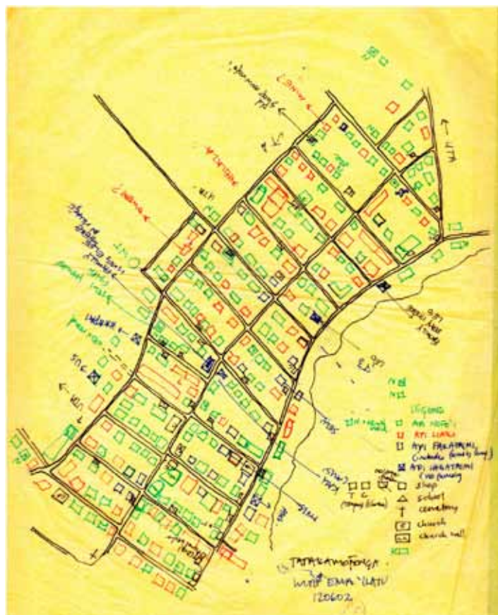
Figure 3: One part of my mapping studies of Tatakamotonga village surveying the occupancy per allotment, green: allotment and house lived in permanently, red: allotment and house abandoned, blue: allotment and house lived in temporarily by the owner, black with an ‘s’: a shop. Tongatapu Island, June 2012, ‘Ilaiu Talei.

For some families, the fale koloa was the only means to generate cash, especially if no one else was working or living overseas. A survey of Tatakamotonga village, during fieldwork in June 2012, shows that on every street there is at least one fale koloa (fig. 3). Sometimes almost every house on that street has a fale koloa —which is a lot of competition! However, today most, if not all, of these fale koloa are not operational. It is common to see such old fale koloa , reused as a storage space or extra bedroom for young male members of the family. Cultural anthropologist Niko Besnier explains Tongan shops “succumbed to