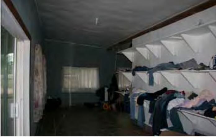
Figure 5: Interior of the shop front space with makeshift sleeping quarters around the corner and behind this partitioning wall an actual bedroom, Vake House, Tatakam tonga village, Tongatapu Island, 'Ilaiu Talei, May 2012.

bus (fig. 4). The fale koloa is a small structure on average between six to ten square metres, usually made from a light frame with corrugated metal or timber cladding. Often the fale koloa is built at the same time with the main house. For this reason, the fale koloa as an economic activity is not involved in constructing the original house, but usually maintains the main house and funds the next stages of the project. Like the owners of a newly built house in Tatakamotonga (fig. 5), they chose to build a fale koloa with one bedroom, kitchen and bathroom facilities in the first stage of construction. The shop's profit pays the utility bills of the house, as they await more remittance to fund the next stage of the project.