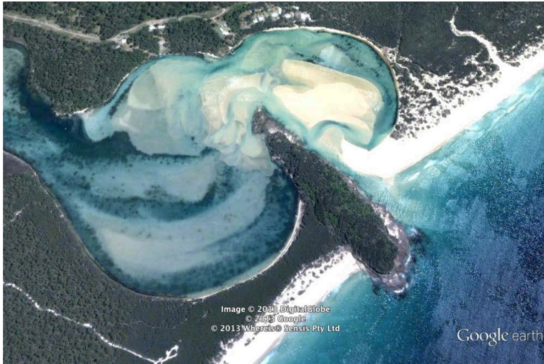
Figure 4: The inlet to Lake Wonboyn Australia (37°15'S 149°58'E) is sheltered by steep rocks, which help the inlet to stay open most of the time but also restrain growth of the inlet on one side.

A more complete classification of inlet morphologies will require consideration of the strength and frequency of freshwater flows Q_{\text{fresh}} compared with the tidal peak discharge as well as the supply of terrigenous sediment Q_{\text{s,ter}} . For example, the Fly River estuary, which is shown by Masselink & Hughes (2003) p 158 as a tide dominated estuary, has a very different appearance from the funnel shaped estuaries around Broad Sound Queensland Australia ( 22° 22'S, 149°44'E). That is because the Fly River has large and persistent Q_{\text{fresh}} , Q_{\text{s,ter}} compared with the rivers and creeks of northern Australia.