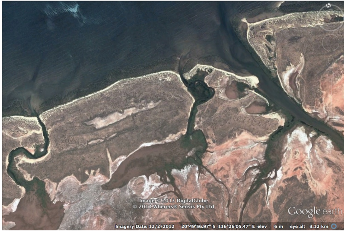
Figure 1: Three inlets on the NW coast of Western Australia near 20°49'S, 116°26'E. The spring tidal amplitude in this area is a_0 = 2.2\text{m} , while the average significant wave height is around \overline{H_s} \approx 0.70\text{m} . Starting from the left, the small river-like system has A_B \approx 0.04\text{km}^2 leading to \hat{Q}_{\text{pot}} / \sqrt{gH_s^5} = 10 . The system in the middle has A_B \approx 0.06\text{km}^2 leading to \hat{Q}_{\text{pot}} / \sqrt{gH_s^5} = 15 , while the funnel shaped system on the right has A_B \approx 0.60\text{km}^2 leading to \hat{Q}_{\text{pot}} / \sqrt{gH_s^5} = 147 .

the smaller ones show wave influence while the larger one is of the canonical funnel shaped tide-dominated type.