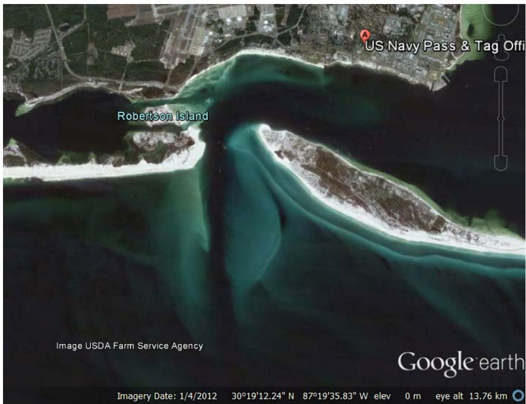
Figure 3: Pensacola Pass on Florida, US near 30°19.5'N 87°18.5'W. The inlet spring tidal prism of P=2.7 \times 10^9 \text{ m}^3 , corresponding to large bay surface area of A_B \approx 477 \text{ km}^2 (FL32399 report, 2012) and mean spring tidal amplitude approximately a_B = 0.27 \text{ m} while average ocean amplitude in this area is a_o = 0.21 \text{ m} . The Bay tide has perfect response to the ocean tide due to large entrance area of the order of 10000 \text{ m}^2 . The average significant wave height is around \overline{H_s} \approx 1 \text{ m} . Two well-developed ebb deltas and large value of \frac{\hat{Q}_{\text{actual}}}{\sqrt{gH_s^3}} = 3029 indicate that the system is tidal dominated estuary while it is wave dominated according to Hayes (1979).