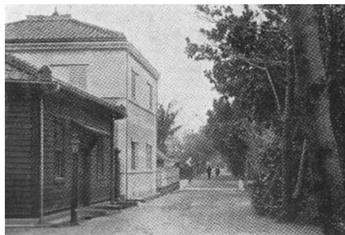
Bonin Island post office and main street

The second colonization attempt of the Bonin Islands in 1875 was successful. This time the Meiji Maru was sent with four Japanese commissioners on board to formally claim the Bonins as Japanese territory under the instruction of the Meiji government. It sailed out of Yokohama on 21 November 1875 (Robertson 1876: 126), seven years after the Meiji Restoration had successfully defeated the Tokugawa Shogunate at a time when Japan was moving toward unification, industrialization and a centralized government system. From the perspective of Foucault's governmentality, this was a time when the Meiji officials began constructing nation-conscious subjects from passive peasants that best suited government policies in imagining a cohesive nation. Foucault's governmentality focuses on power and the social control of populations by the state through such authoritarian apparatuses as government departments, hospitals, schools and prisons. With Japan's modernization, the koseki, as an instrument of surveillance and control, became ubiquitous throughout processes of social administration.