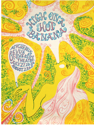
Fig. 2. Hot Banana: Poster announcing the 1967 Archi Revue "High on a Hot Banana"