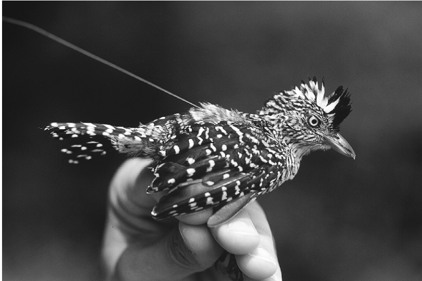
PLATE 1. Barred Antshrike Thamnophilus doliatus with transistor antenna.

forest or fencerow. The effect of distance home on selection for forest appears to reflect a change in the perception or response to exposure. Because crossing open habitat exposes forest birds to the risk of predation (Lima and Dill 1990, Rodríguez et al. 2001, Turcotte and Desrochers 2003), a change in gap crossing may mean that birds were more willing to take risks closer to their home territories when the benefit of doing so was more tangible.