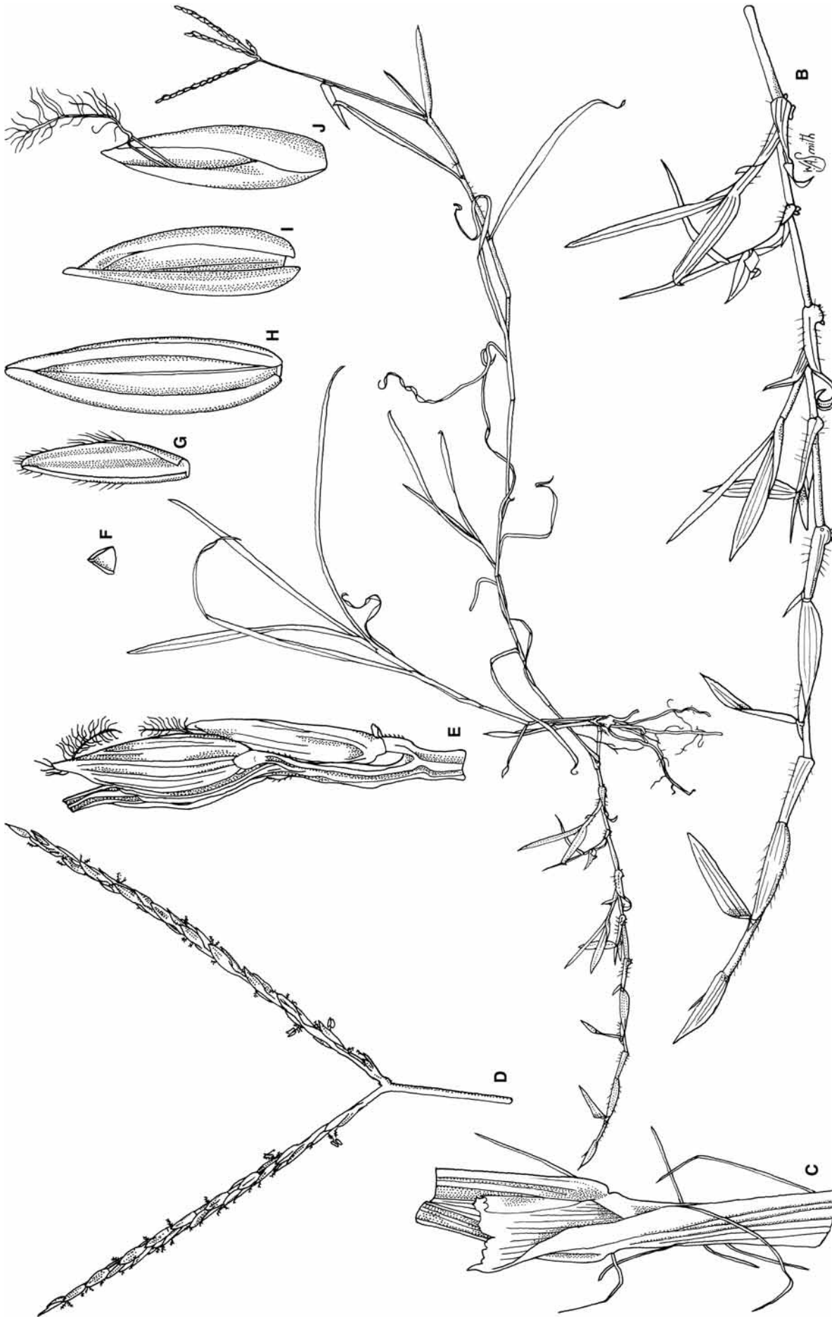
Plate 2. Morphological characteristics of Digitaria didactyla (Queensland blue couch form): A Plant (X 0.5 magnification) showing prostrate to decumbent habit; B Stolon (X 1.3) with simple nodes; C Membranous ligule (X 7); D Digitate inflorescence (X 1.8); E Raceme (part) showing arrangement of spikelets (X 14); F Upper glume; G Lower glume; H Upper floret; I Lower floret; J Palea (lower floret). (Drawing: W. Smith; copyright retained by the Queensland Herbarium).