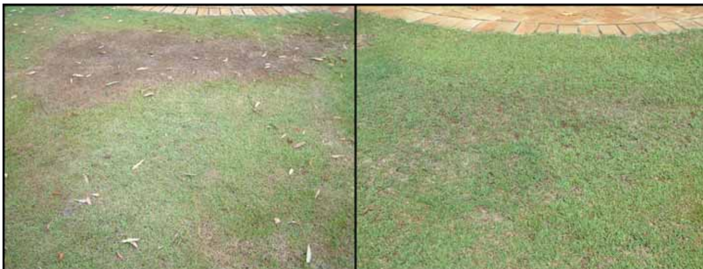
Plate 3. An apparently dead patch of Queensland blue couch ( top ) almost completely recovered 10 days after a significant rainfall event ( bottom ) (after Loch 2007).

Salinity Tolerance. Both Queensland blue couch and Aussiblu Swazigrass showed very low tolerance of salinity in hydroponic screening and field experiments by Loch et al. (2006). While it is possible that other ecotypes of Queensland blue couch may have evolved with higher salinity tolerance, there are no anecdotal reports to support this. In this respect, it is noteworthy that D. didactyla (Serangoon grass) was ranked among the least tolerant group in salinity studies by Uddin et al. (2011).