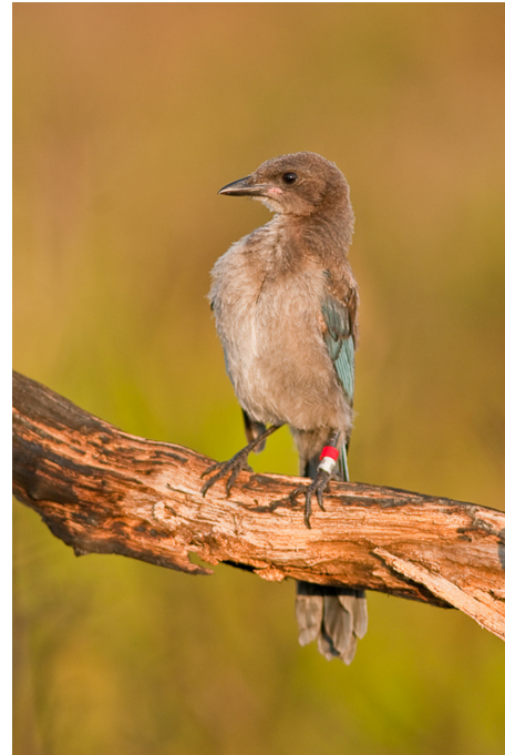
Figure 1. A juvenile Florida scrub-jay. Although juveniles have blue wings and tails like adults, they are easily distinguished by their brown heads, which are blue in adults.

test the significance of the phenotypic and genetic correlations, we constrained the correlation to zero or one and compared the model to one in which the correlation was estimated. Note that because correlations (or more generally, covariances) need not be positive, these tests are chi-squared distributed with 1 degree of freedom. All quantitative genetic models were run using the software ASReml 3.0 (Gilmour et al. 2009).