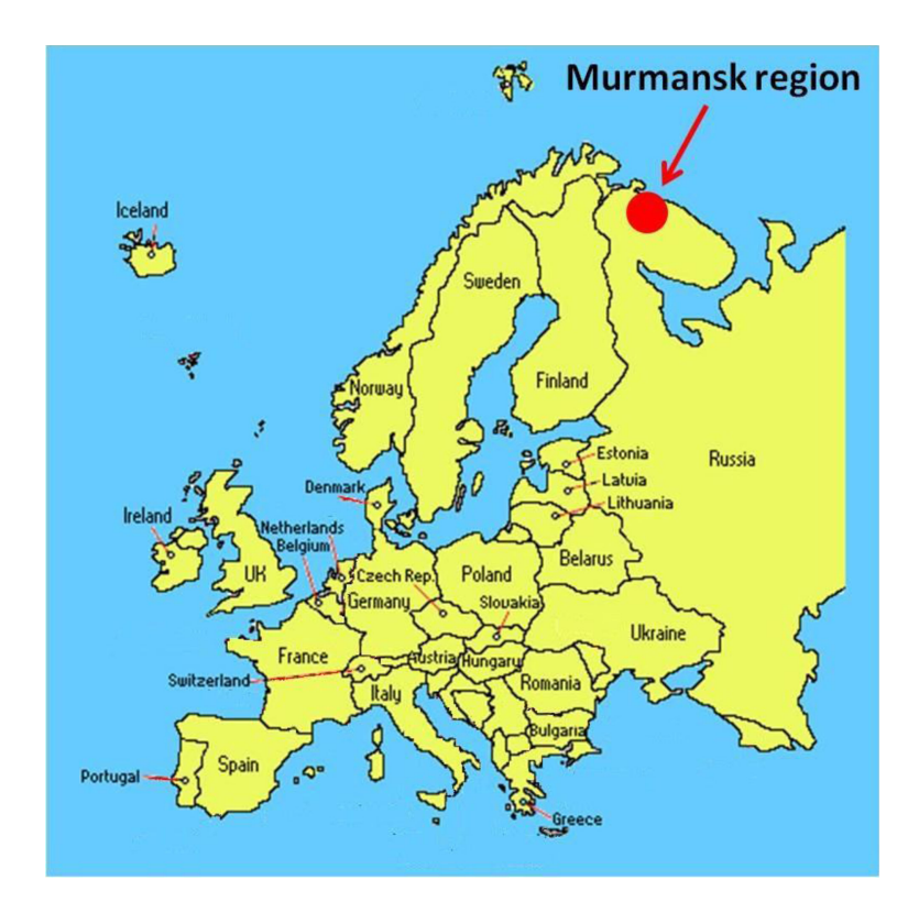
Fig. 1. Murmansk region in the northwest Russia.

habits (8). Earlier consistent evidence emphasized that even non-smokers may develop chronic airflow obstruction (9,10). Inhalational exposures such as occupational dusts and chemicals are harmful environmental contaminants (11). The Murmansk region includes areas where its inhabitants are exposed to contaminants from mining industries. The prevalence of smoking (12) and COPD (13) is high in Russia, though the simple statistics probably do not reflect the scale of the problem in this region. There is an urgent need to investigate the persistence of chronic cough/phlegm symptoms by using specific questions about their predictors, onset and duration.