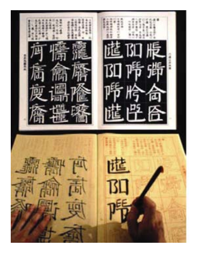
Fig. 2 Xu Bing. Square Word Calligraphy , 2005. New English (Square Word) Calligraphy