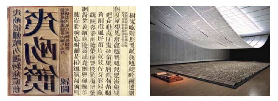
Fig. 1 Xu Bing. Book from the Sky , 1987–1991. Mixed Media Installation. The National Gallery of Canada, Ottawa